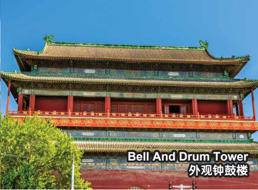
Bell And Drum Tower 外观钟鼓楼