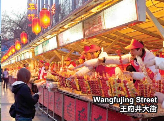
Wangfujing Street 王府井大街