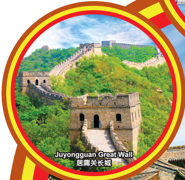
Juyongguan Great Wall 居庸关长城