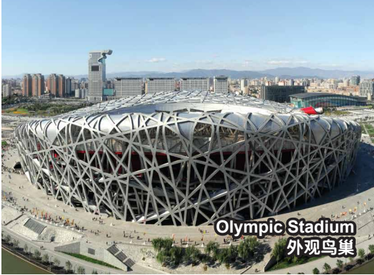
Olympic Stadium 外观鸟巢