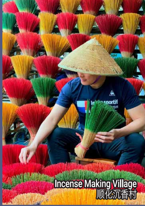
Incense Making Village 顺化沉香村