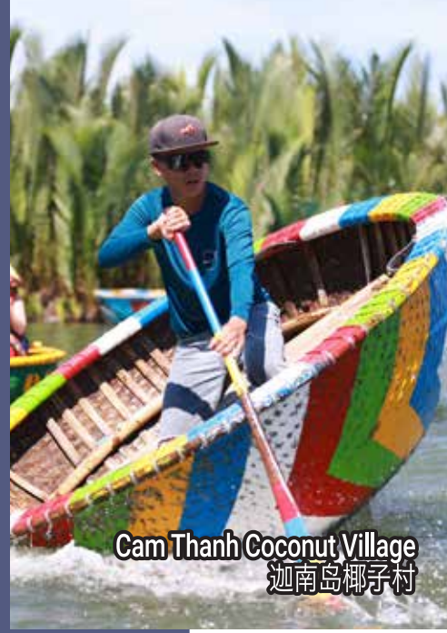
Cam Thanh Coconut Village 迦南岛椰子村