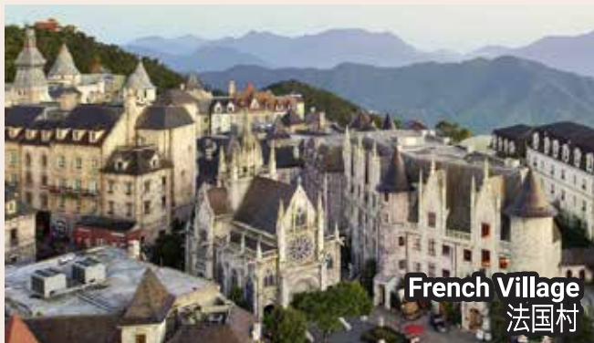
French Village 法国村