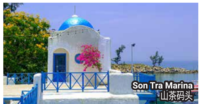
Son Tra Marina 山茶码头