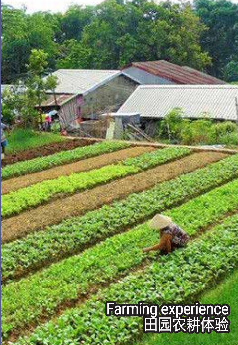
Farming experience 田园农耕体验