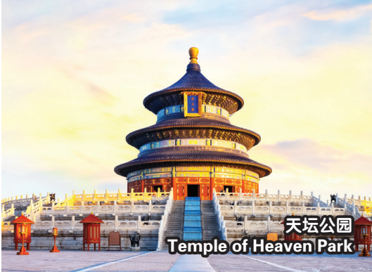
天坛公园 Temple of Heaven Park