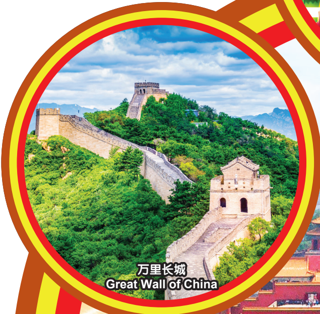
万里长城 Great Wall of China