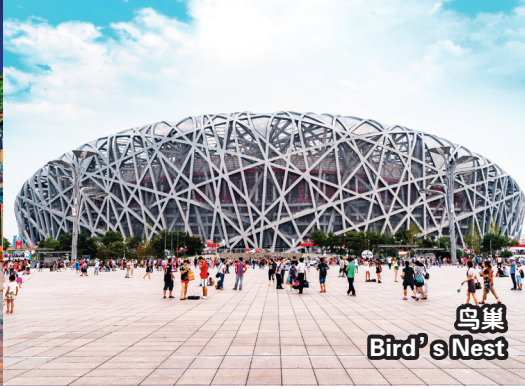
鸟巢 Bird's Nest