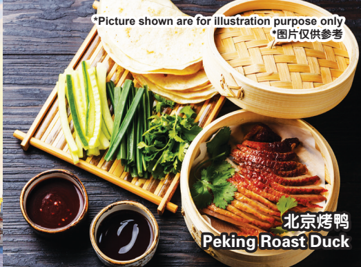
北京烤鸭 Peking Roast Duck