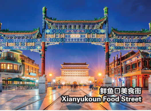
鲜鱼口美食街 Xianyukou Food Street