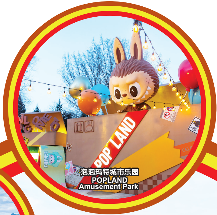
泡泡玛特城市乐园 POPLAND Amusement Park