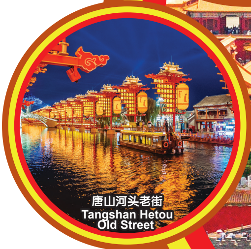
唐山河头老街 Tangshan Hetou Old Street

行程次序，以当地旅社安排为准。 Sequences of Itinerary are subject to local arrangement.