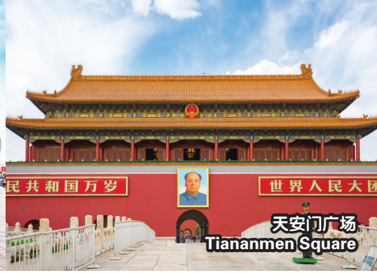
天安门广场 Tiananmen Square