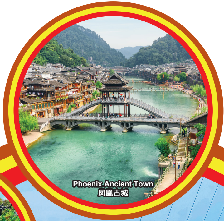
Phoenix Ancient Town 凤凰古城