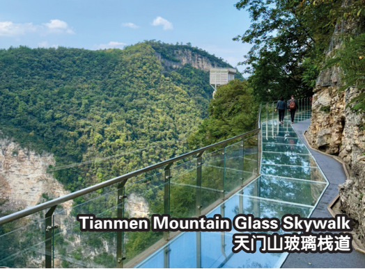
Tianmen Mountain Glass Skywalk 天门山玻璃栈道