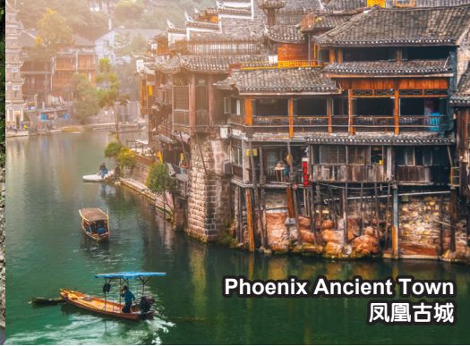
Phoenix Ancient Town 凤凰古城