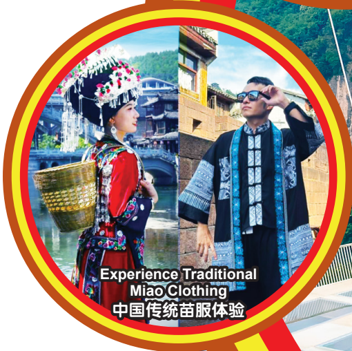
Experience Traditional Miao Clothing 中国传统苗服体验