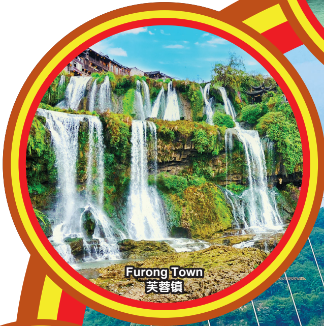
Furong Town 芙蓉镇