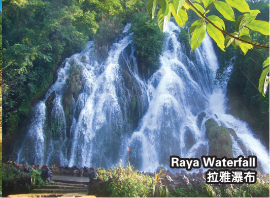
Raya Waterfall 拉雅瀑布