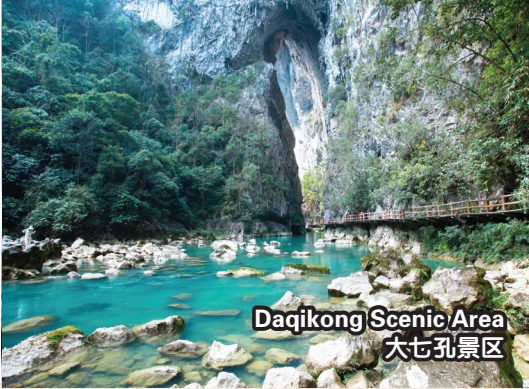
Daqikong Scenic Area 大七孔景区