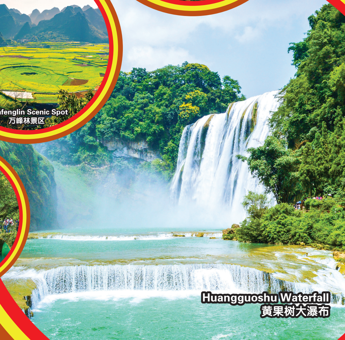
Huangguoshu Waterfall 黄果树大瀑布

行程次序，以当地旅社安排为准。 Sequences of Itinerary are subject to local arrangement.