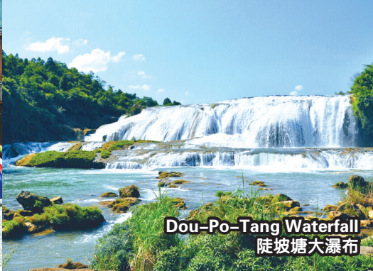
Dou-Po-Tang Waterfall 陡坡塘大瀑布