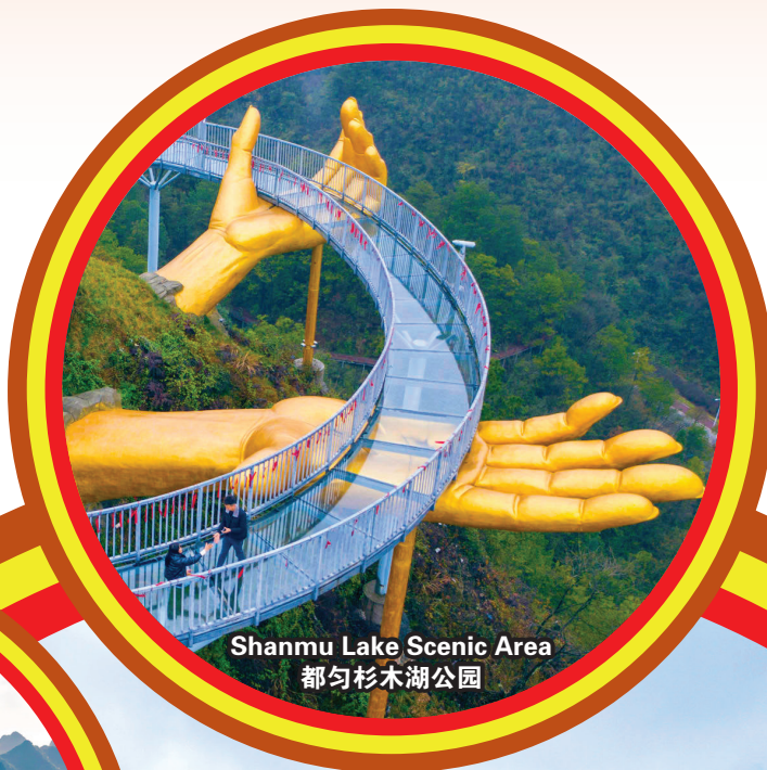
Shanmu Lake Scenic Area 都匀杉木湖公园