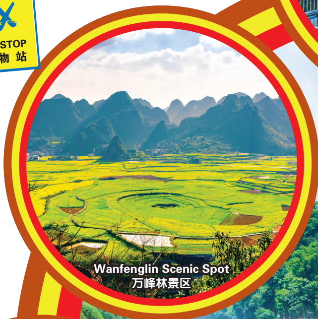
Wanfenglin Scenic Spot 万峰林景区