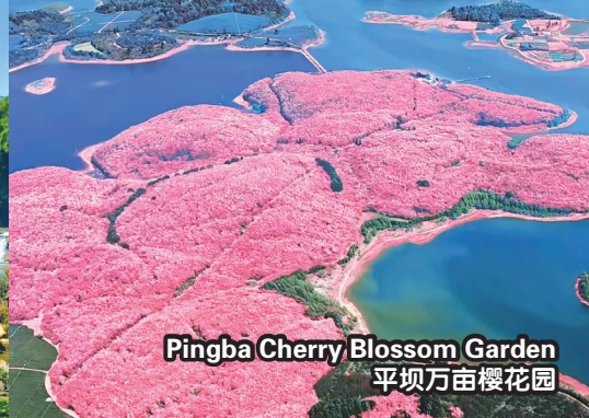
Pingba Cherry Blossom Garden 平坝万亩樱花园