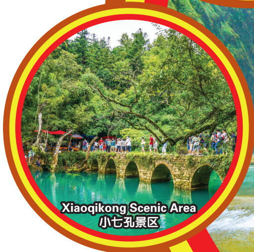
Xiaoqikong Scenic Area 小七孔景区