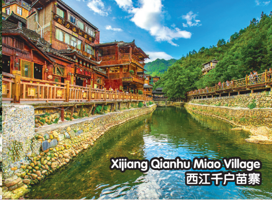
Xijiang Qianhu Miao Village 西江千户苗寨