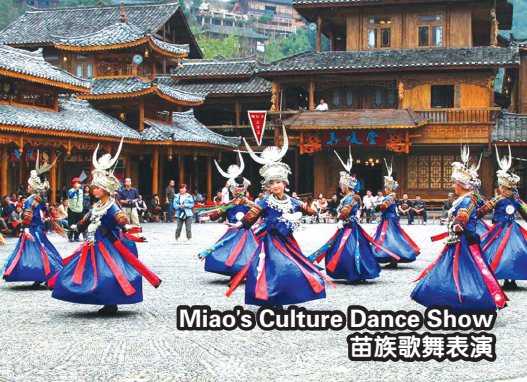
Miao's Culture Dance Show 苗族歌舞表演