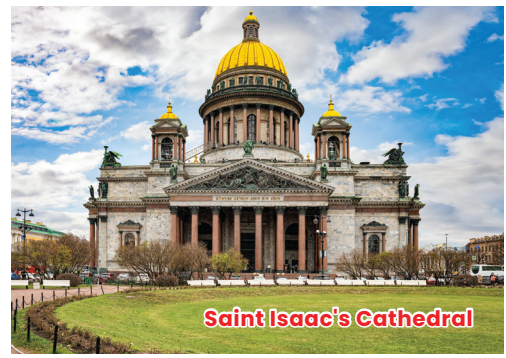
Saint Isaac's Cathedral