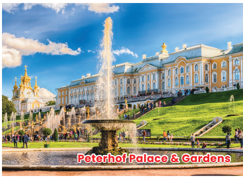
Peterhof Palace & Gardens