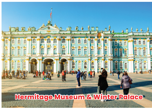
Hermitage Museum & Winter Palace