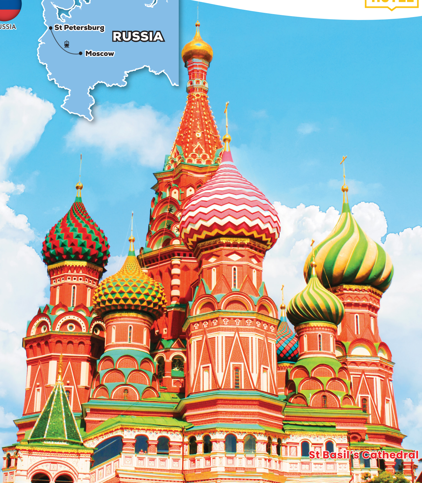
St Basil's Cathedral