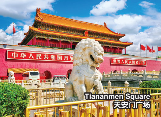
Tiananmen Square 天安门广场