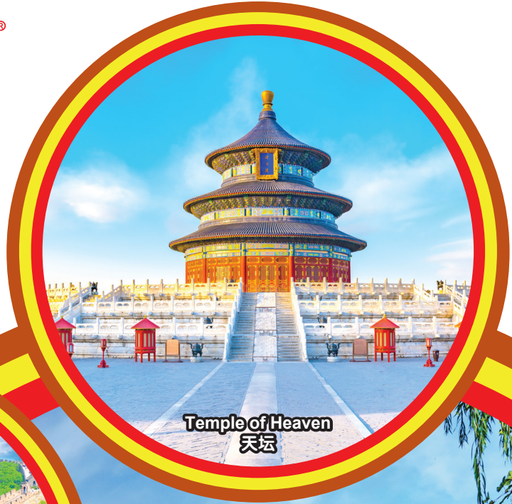
Temple of Heaven 天坛