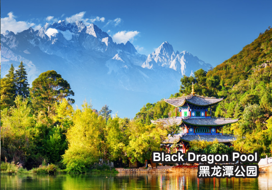
Black Dragon Pool 黑龙潭公园