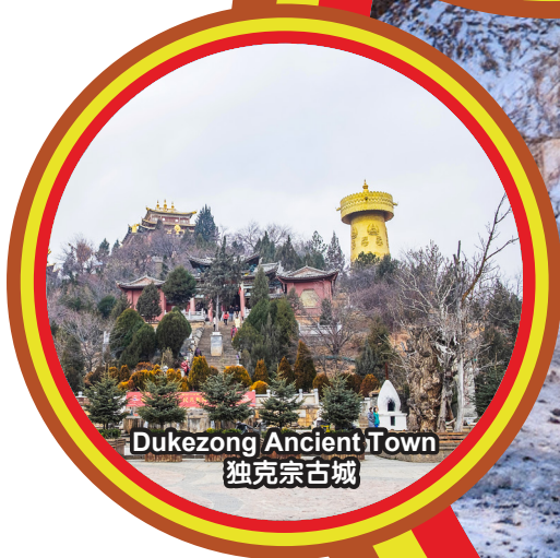
Dukezong Ancient Town 独克宗古城