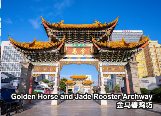
Golden Horse and Jade Rooster Archway 金马碧鸡坊