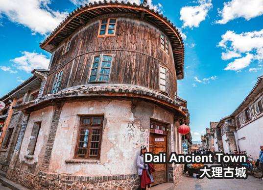
Dali Ancient Town 大理古城