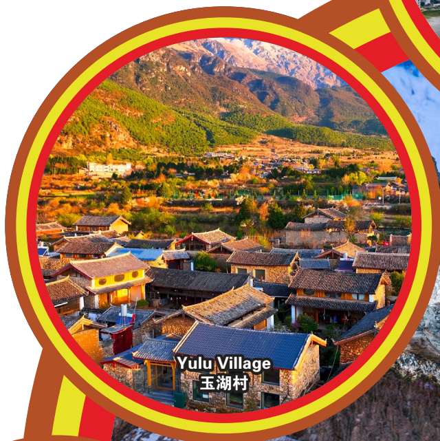
Yulu Village 玉湖村