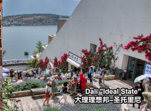
Dali "Ideal State" 大理理想邦-圣托里尼