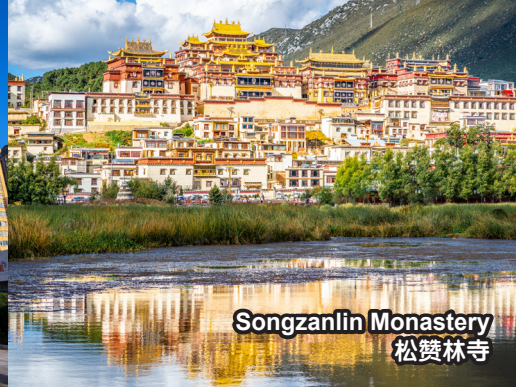
Songzanlin Monastery 松赞林寺