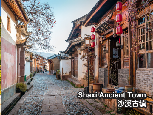
Shaxi Ancient Town 沙溪古镇