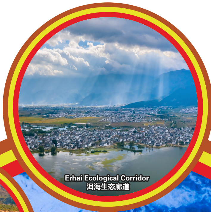
Erhai Ecological Corridor 洱海生态廊道