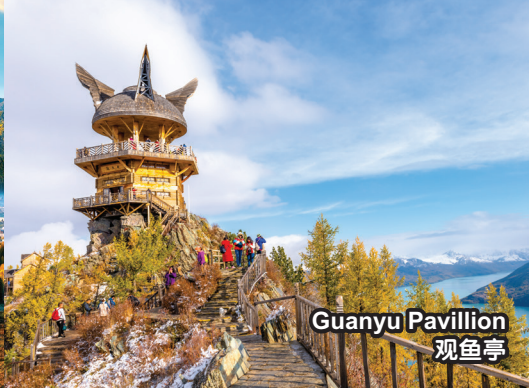
Guanyu Pavilion 观鱼亭