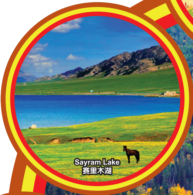
Sayram Lake 赛里木湖