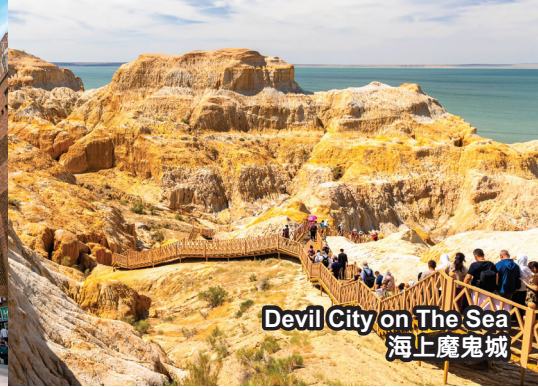
Devil City on The Sea 海上魔鬼城