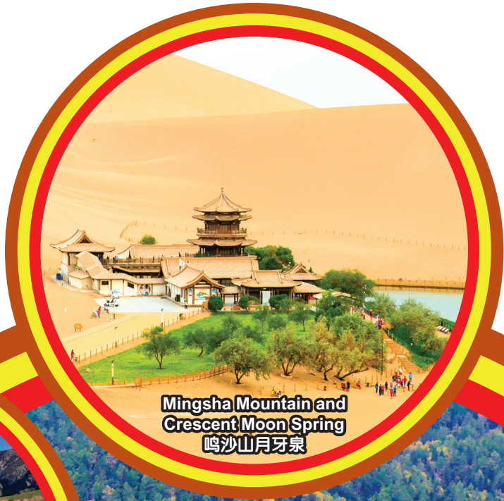
Mingsha Mountain and Crescent Moon Spring 鸣沙山月牙泉