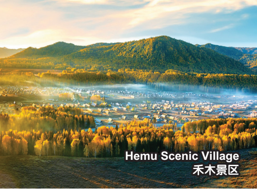
Hemu Scenic Village 禾木景区