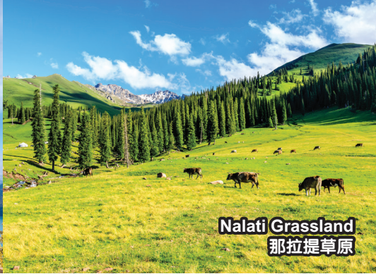
Nalati Grassland 那拉提草原