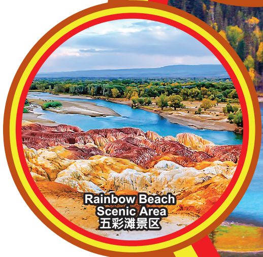
Rainbow Beach Scenic Area 五彩滩景区