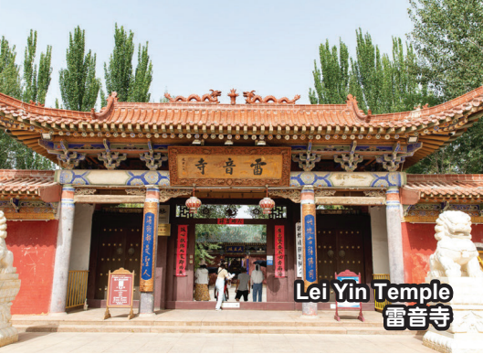
Lei Yin Temple 雷音寺