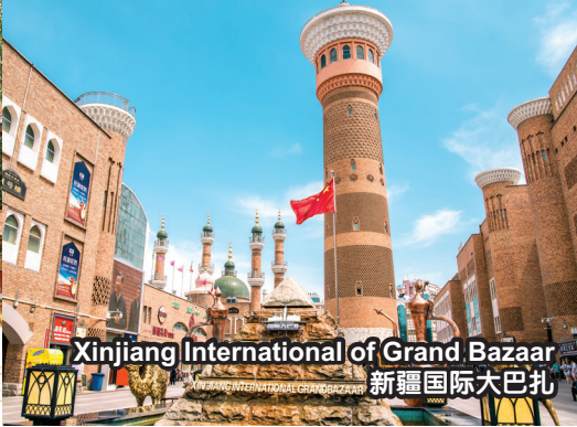
Xinjiang International of Grand Bazaar 新疆国际大巴扎