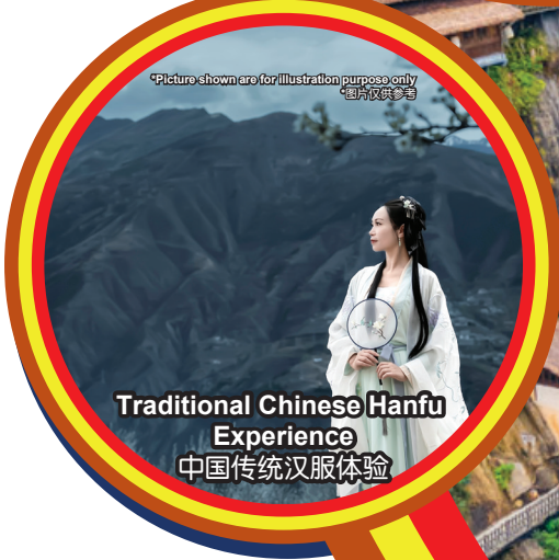
Traditional Chinese Hanfu Experience 中国传统汉服体验

*Picture shown are for illustration purpose only *图片仅供参考