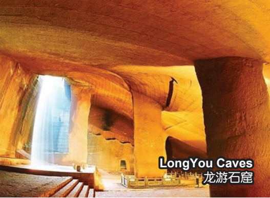
Longyou Caves 龙游石窟