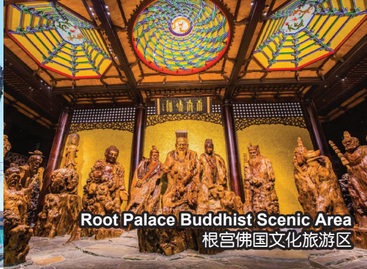
Root Palace Buddhist Scenic Area 根宫佛国文化旅游区