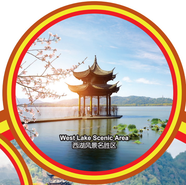
West Lake Scenic Area 西湖风景名胜區