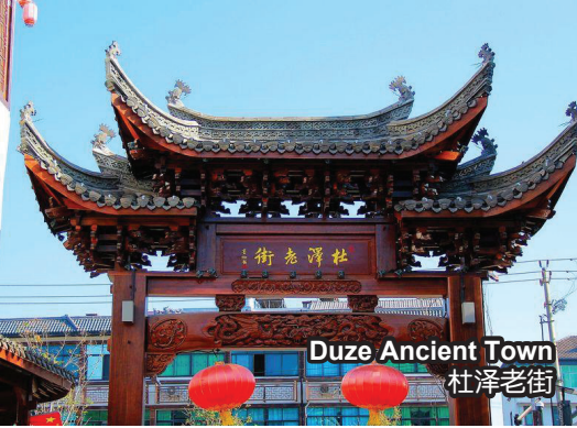
Duze Ancient Town 杜泽老街