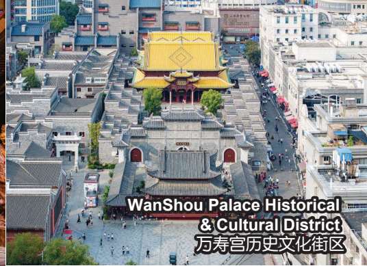
WanShou Palace Historical & Cultural District 万寿宫历史文化街区