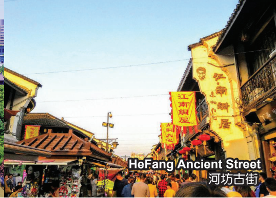
Hefang Ancient Street 河坊古街