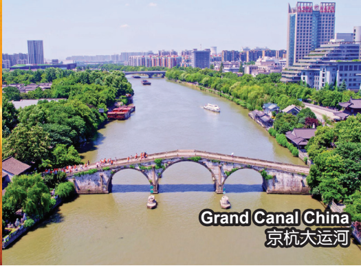
Grand Canal China 京杭大运河