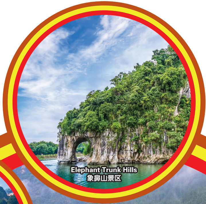
Elephant Trunk Hills 象鼻山景区