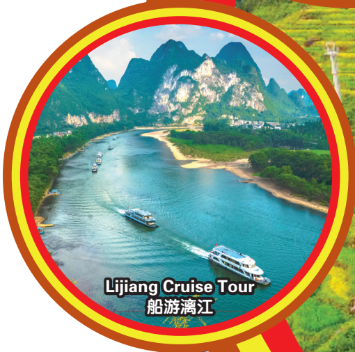
Lijiang Cruise Tour 船游漓江