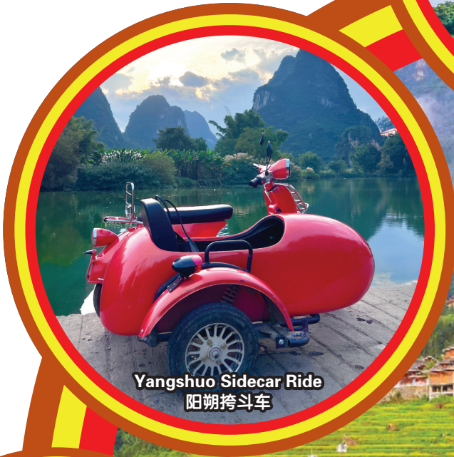
Yangshuo Sidecar Ride 阳朔跨斗车