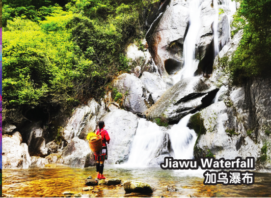
Jiawu Waterfall 加乌瀑布