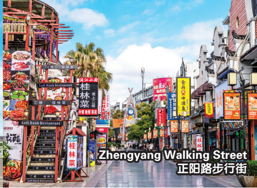
Zhengyang Walking Street 正陽路步行街