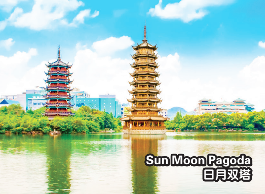
Sun Moon Pagoda 日月双塔