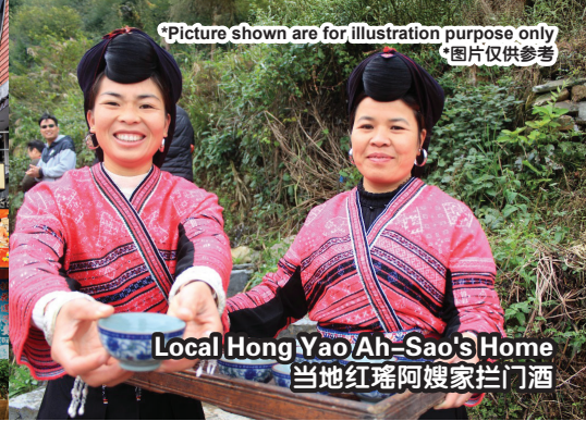
Local Hong Yao Ah-Sao's Home 當地紅瑤阿嫂家拦门酒

*Picture shown are for illustration purpose only *图片仅供参考