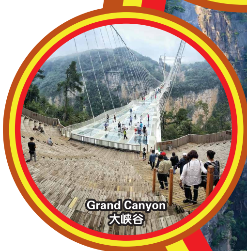
Grand Canyon 大峡谷

行程次序，以当地旅社安排为准。 Sequences of Itinerary are subject to local arrangement.