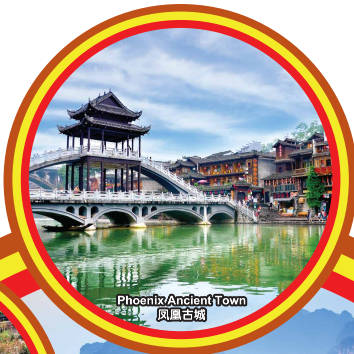
Phoenix Ancient Town 凤凰古城