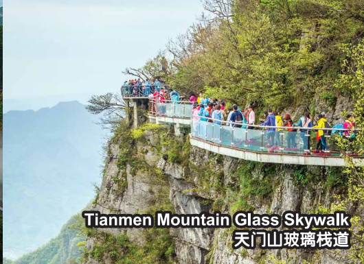
Tianmen Mountain Glass Skywalk 天门山玻璃栈道