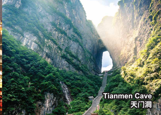
Tianmen Cave 天门洞