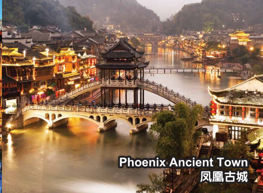
Phoenix Ancient Town 凤凰古城