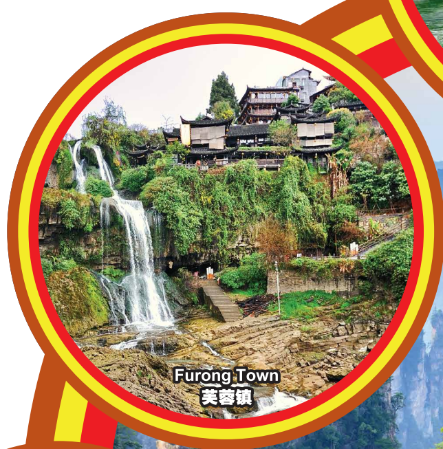
Furong Town 芙蓉镇