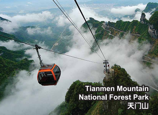
Tianmen Mountain National Forest Park 天门山