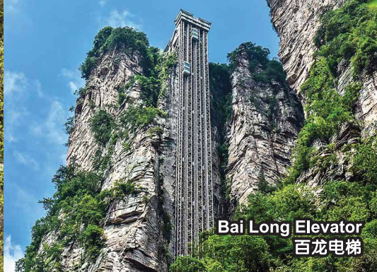
Bai Long Elevator 百龙电梯