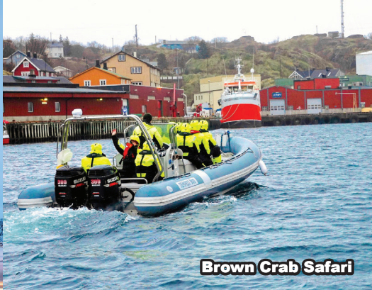
Brown Crab Safari