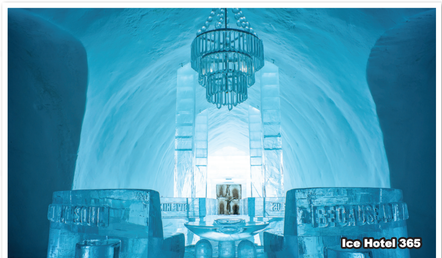
Ice Hotel 365

Note : Northern Lights (Aurora) is a natural phenomenon, Golden Destination unable to guarantee the appearance of during your visit at anytime.