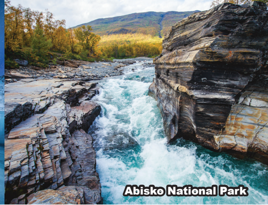
Abisko National Park