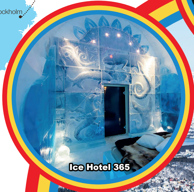
Ice Hotel 365