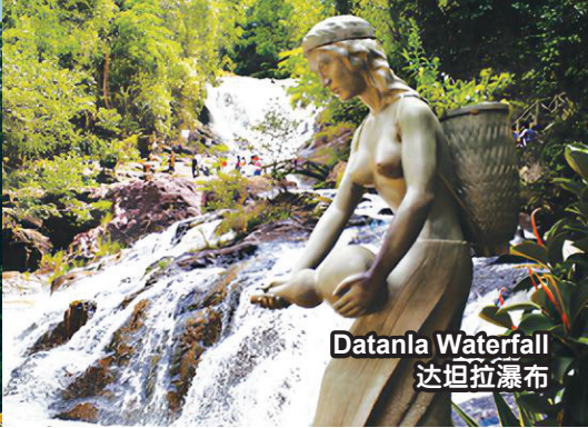
Datanla Waterfall 达坦拉瀑布