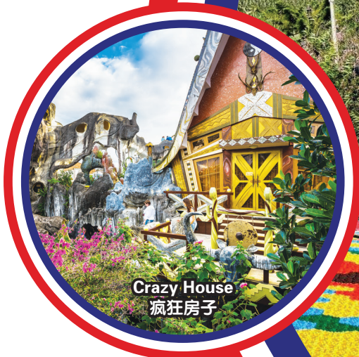
Crazy House 疯狂房子