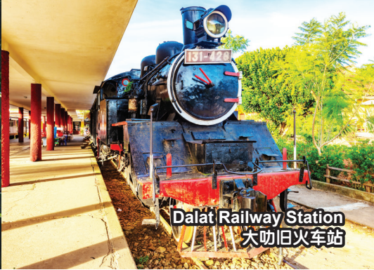
Dalat Railway Station 大叻旧火车站