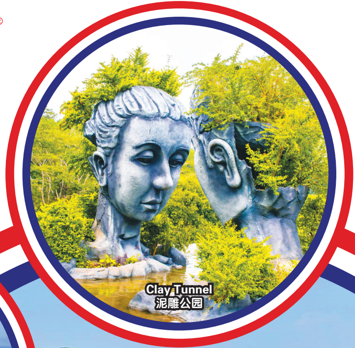
Clay Tunnel 泥雕公园