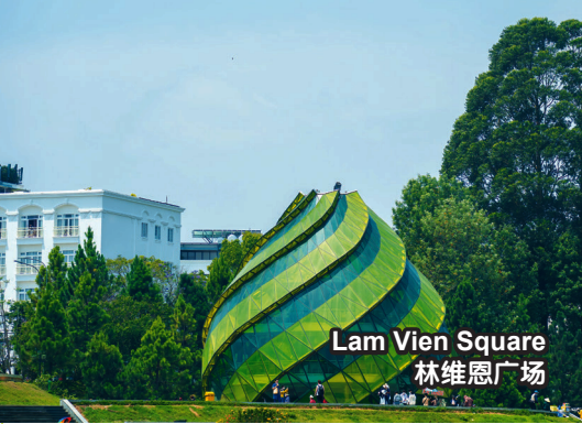
Lam Vien Square 林维恩广场