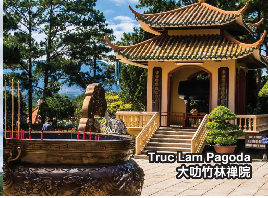
Truc Lam Pagoda 大叻竹林禅院