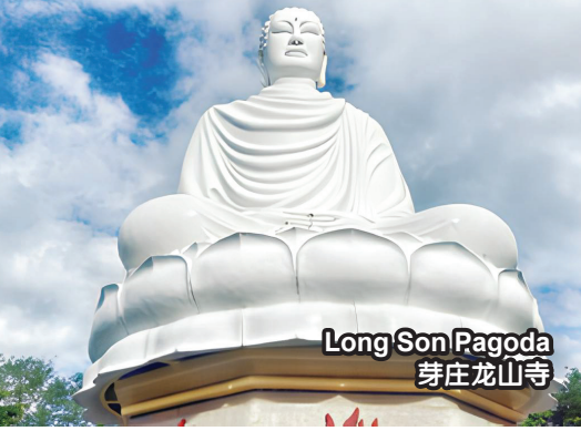
Long Son Pagoda 芽庄龙山寺