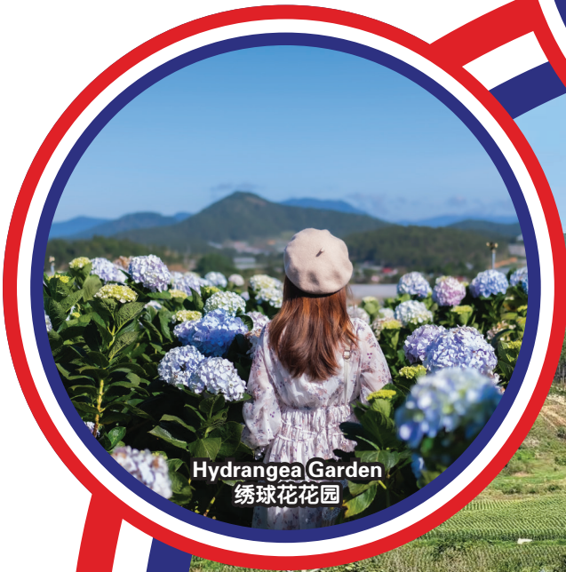
Hydrangea Garden 绣球花花园