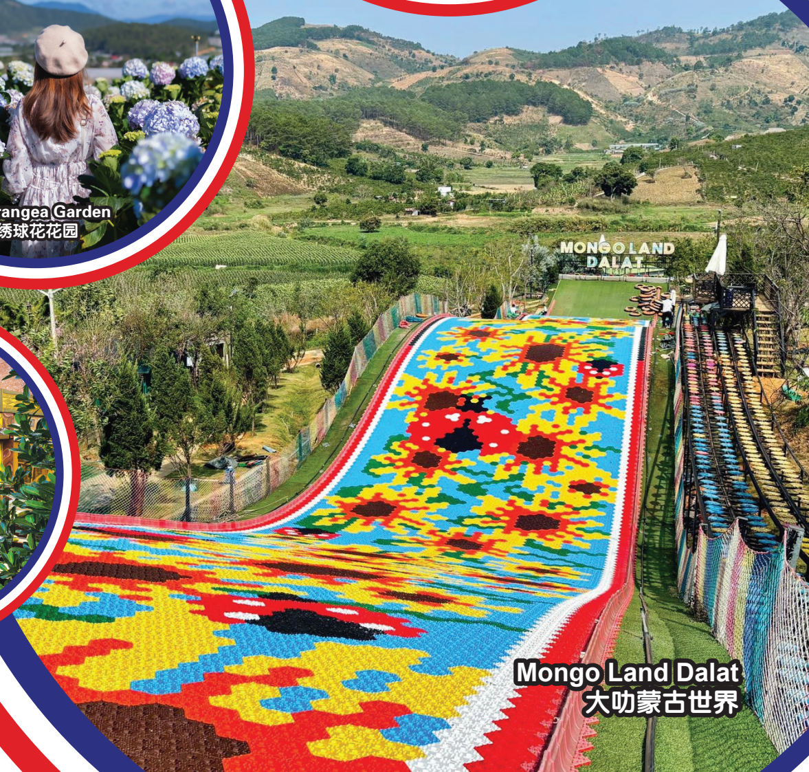
MONGOL LAND DALAT