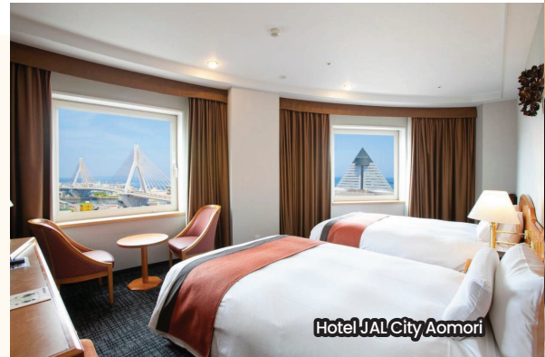
Hotel JAL City Aomori