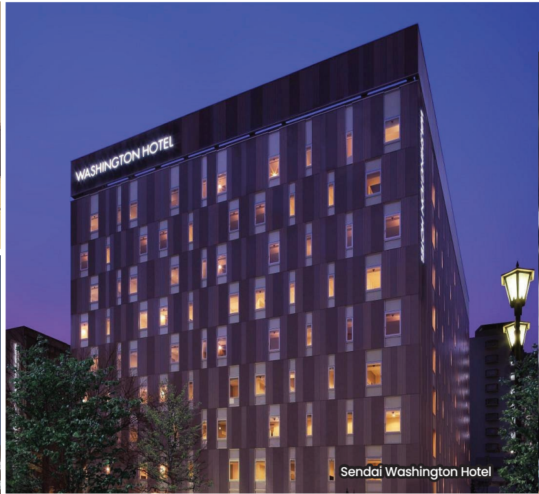
Sendai Washington Hotel