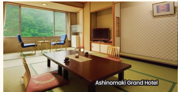
Ashinomaki Grand Hotel

*Triple Room Sharing Will Be Base on Extra Roll in Bed Basis. / *任何三人房或加床统一采用折叠式或床垫为标准。