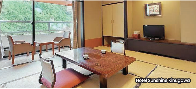
Hotel Sunshine Kinugawa