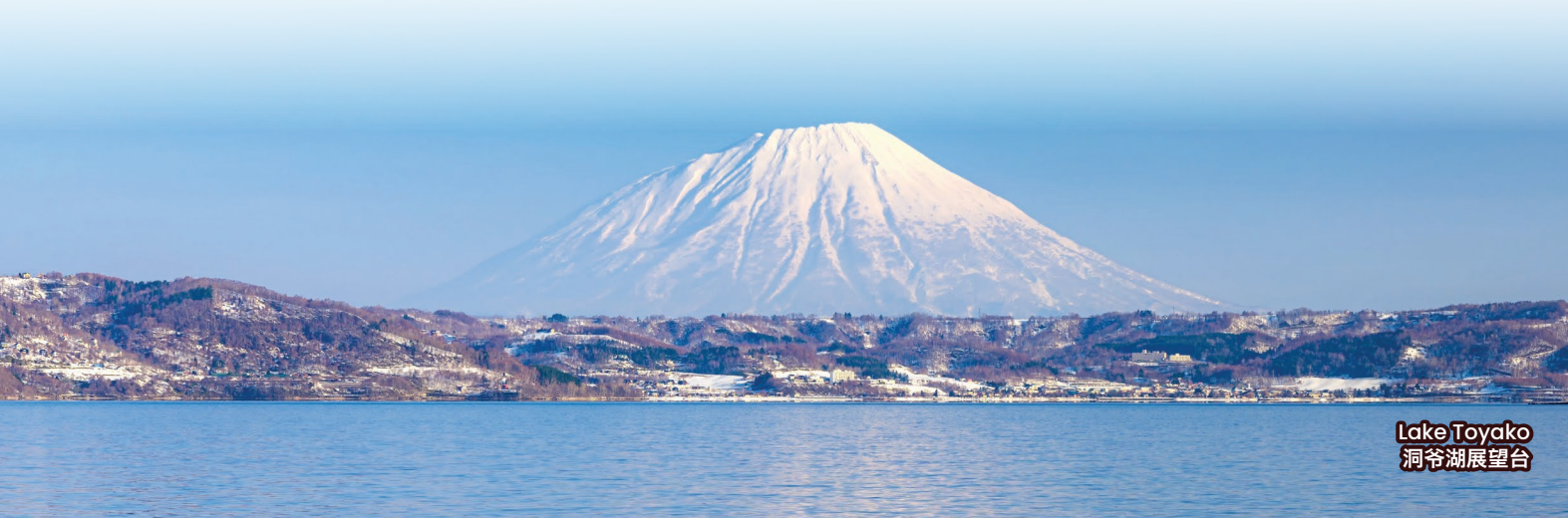
Lake Toyako 洞爷湖展望台