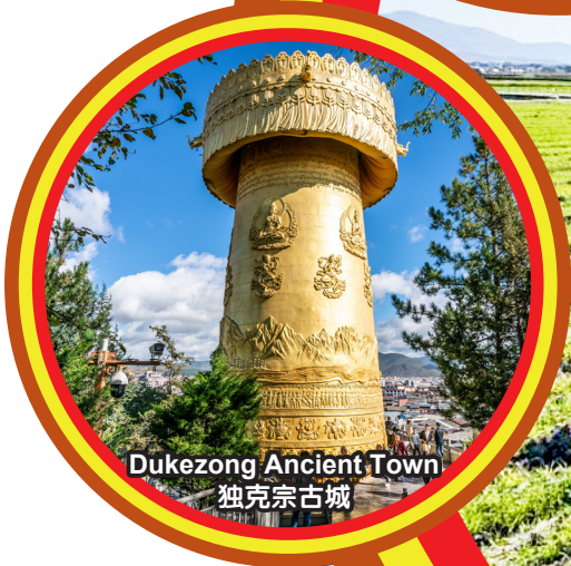
Dukezong Ancient Town 独克宗古城