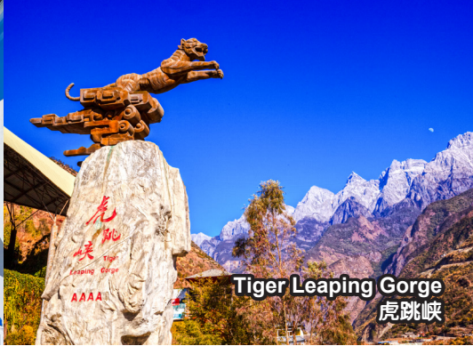
Tiger Leaping Gorge 虎跳峡