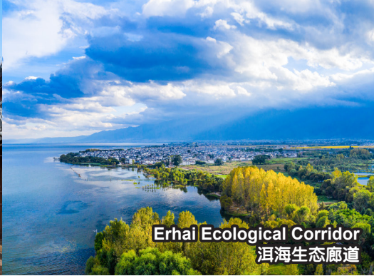
Erhai Ecological Corridor 洱海生态廊道