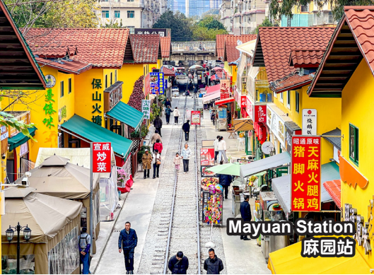
Mayuan Station 麻园站