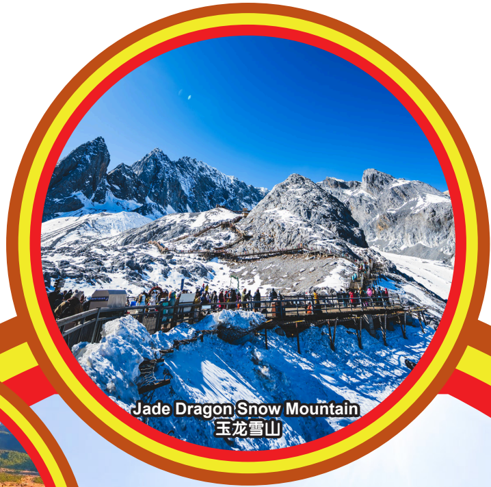
Jade Dragon Snow Mountain 玉龙雪山