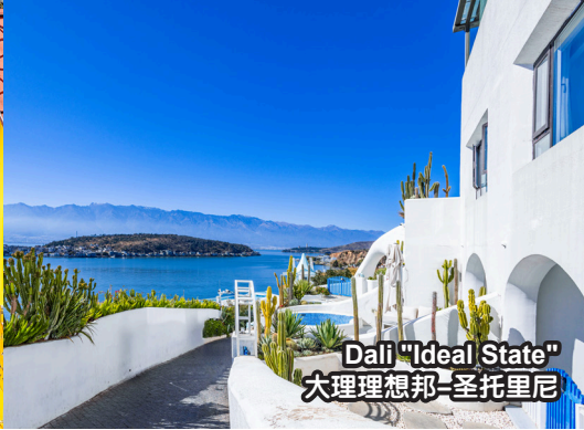
Dali "Ideal State" 大理理想邦-圣托里尼