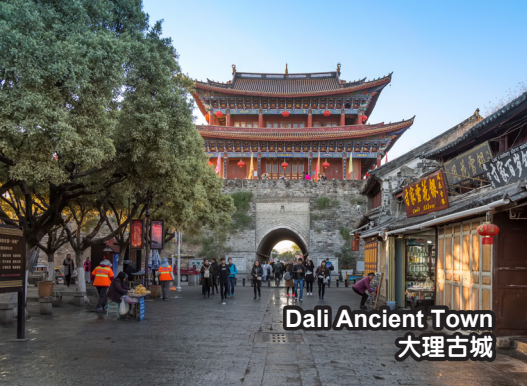
Dali Ancient Town 大理古城