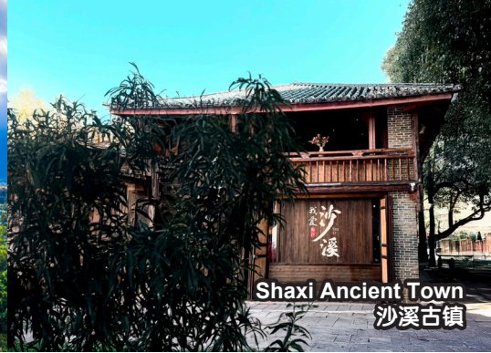
Shaxi Ancient Town 沙溪古镇