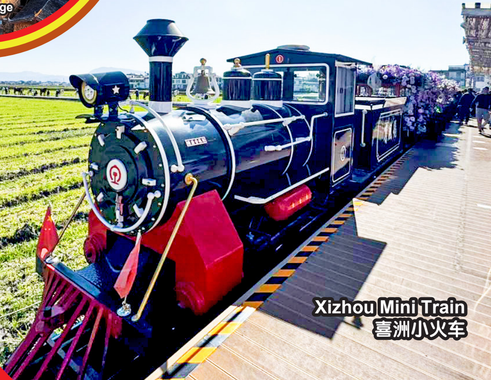
Xizhou Mini Train 喜洲小火车

行程次序，以当地旅社安排为准。 Sequences of Itinerary are subject to local arrangement.