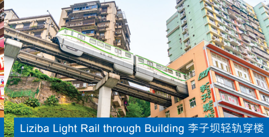
Liziba Light Rail through Building 李子坝轻轨穿楼