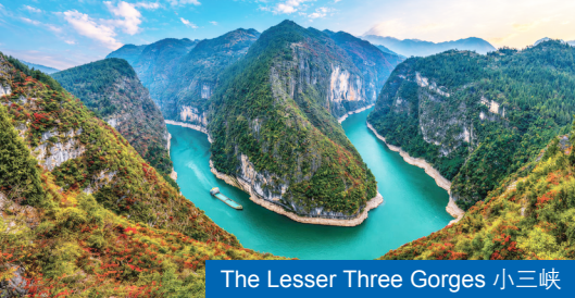
The Lesser Three Gorges 小三峡