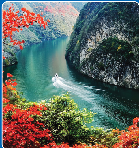
Yangtze Three Gorges 长江三峡