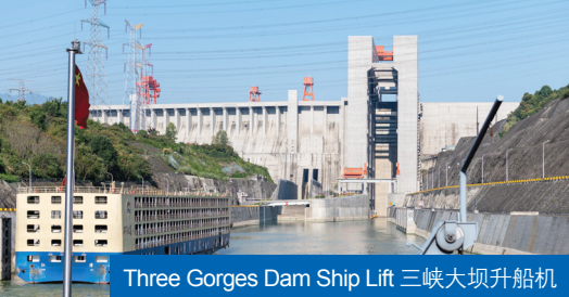
Three Gorges Dam Ship Lift 三峡大坝升船机