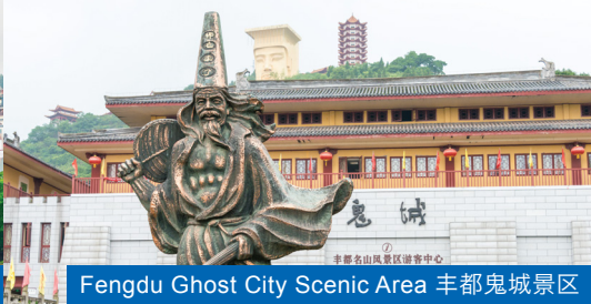
Fengdu Ghost City Scenic Area 丰都鬼城景区