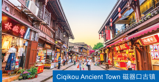
Ciqikou Ancient Town 磁器口古镇