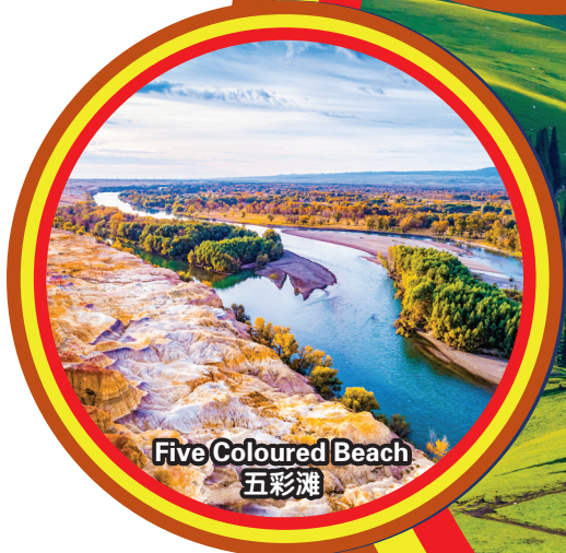
Five Coloured Beach 五彩滩