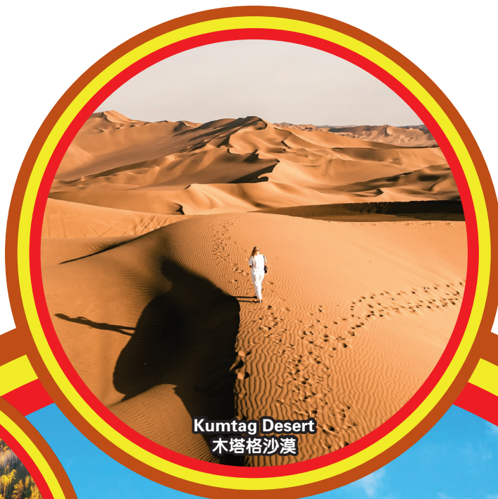
Kumtag Desert 木塔格沙漠