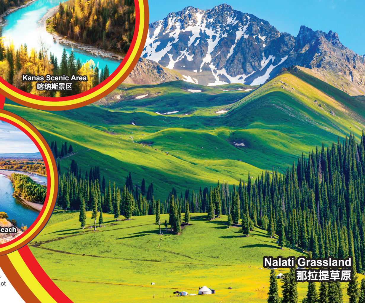
Nalati Grassland 那拉提草原

行程次序，以当地旅社安排为准。 Sequences of Itinerary are subject to local arrangement.