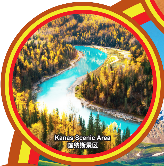
Kanas Scenic Area 喀纳斯景区