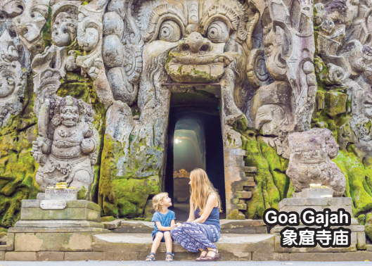
Goa Gajah 象窟寺庙