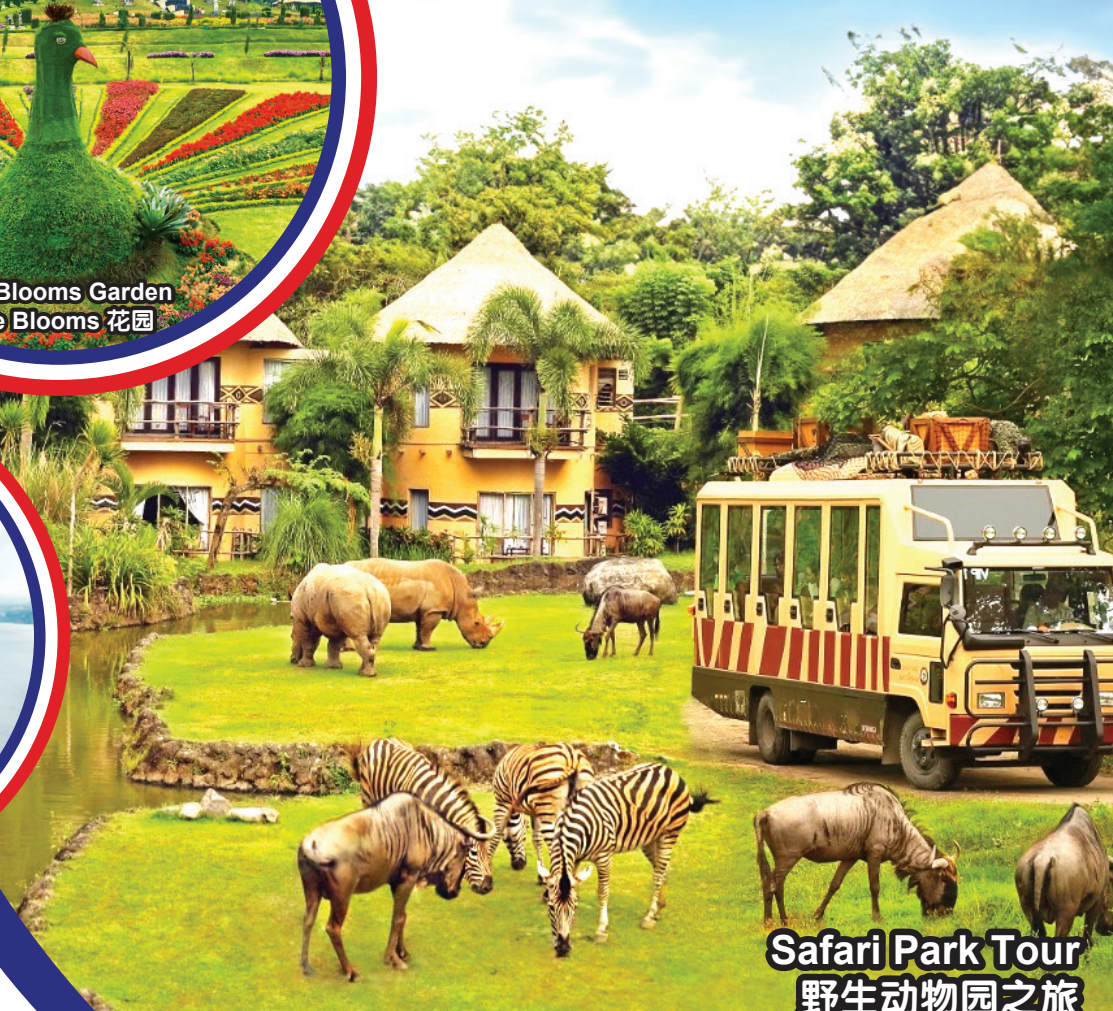
Safari Park Tour 野生动物园之旅

行程次序，以当地旅社安排为准。 Sequences of Itinerary are subject to local arrangement.