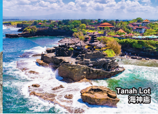
Tanah Lot 海神庙