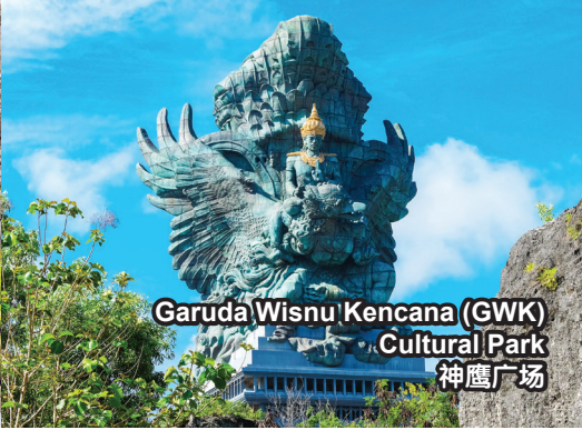
Garuda Wisnu Kencana (GWK) Cultural Park 神鹰广场