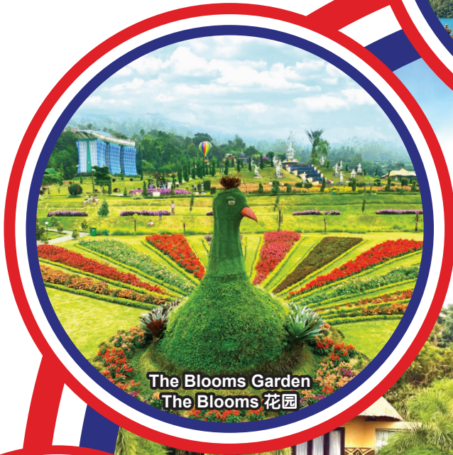
The Blooms Garden The Blooms 花园