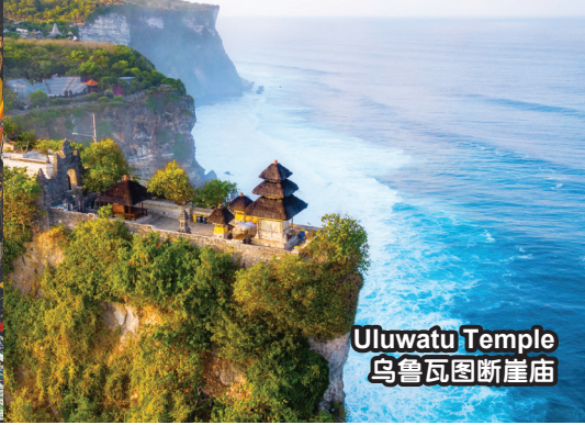
Uluwatu Temple 乌鲁瓦图断崖庙