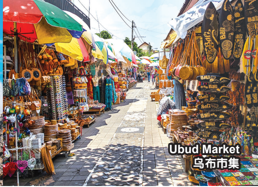
Ubud Market 乌布市集