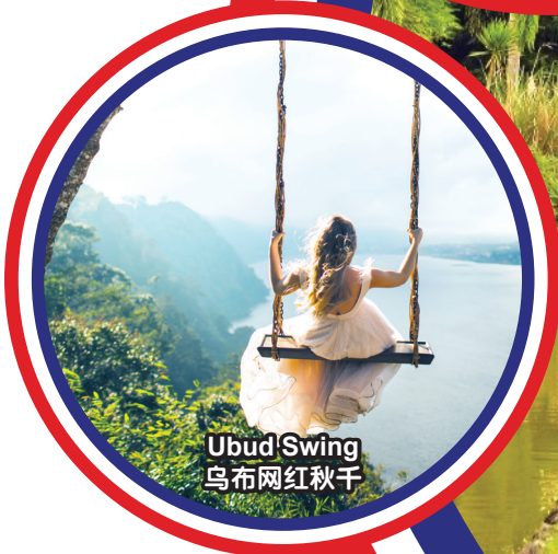
Ubud Swing 乌布网红秋千