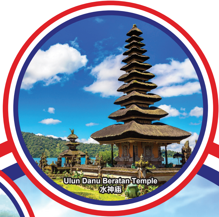
Ulun Danu Beratan Temple 水神庙