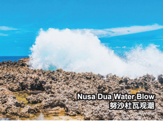
Nusa Dua Water Blow 努沙杜瓦观潮