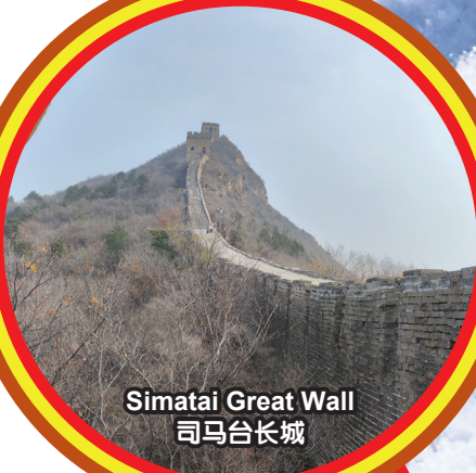
Simatai Great Wall 司马台长城