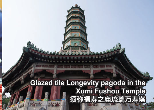
Glazed tile Longevity pagoda in the Xumi Fushou Temple 须弥福寿之庙琉璃万寿塔