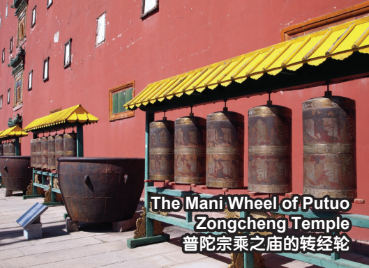
The Mani Wheel of Putuo Zongcheng Temple 普陀宗乘之庙的转经轮