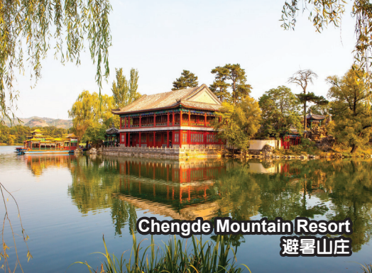
Chengde Mountain Resort 避暑山庄