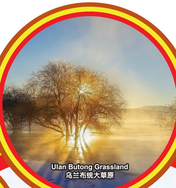
Ulan Butong Grassland 乌兰布统大草原