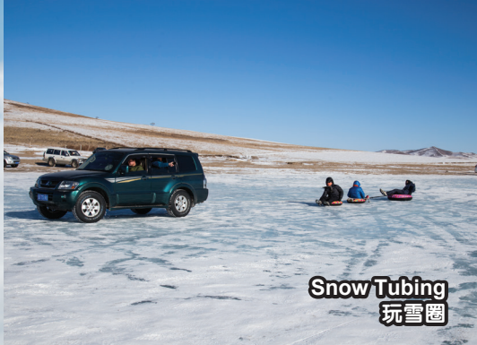
Snow Tubing 玩雪圈