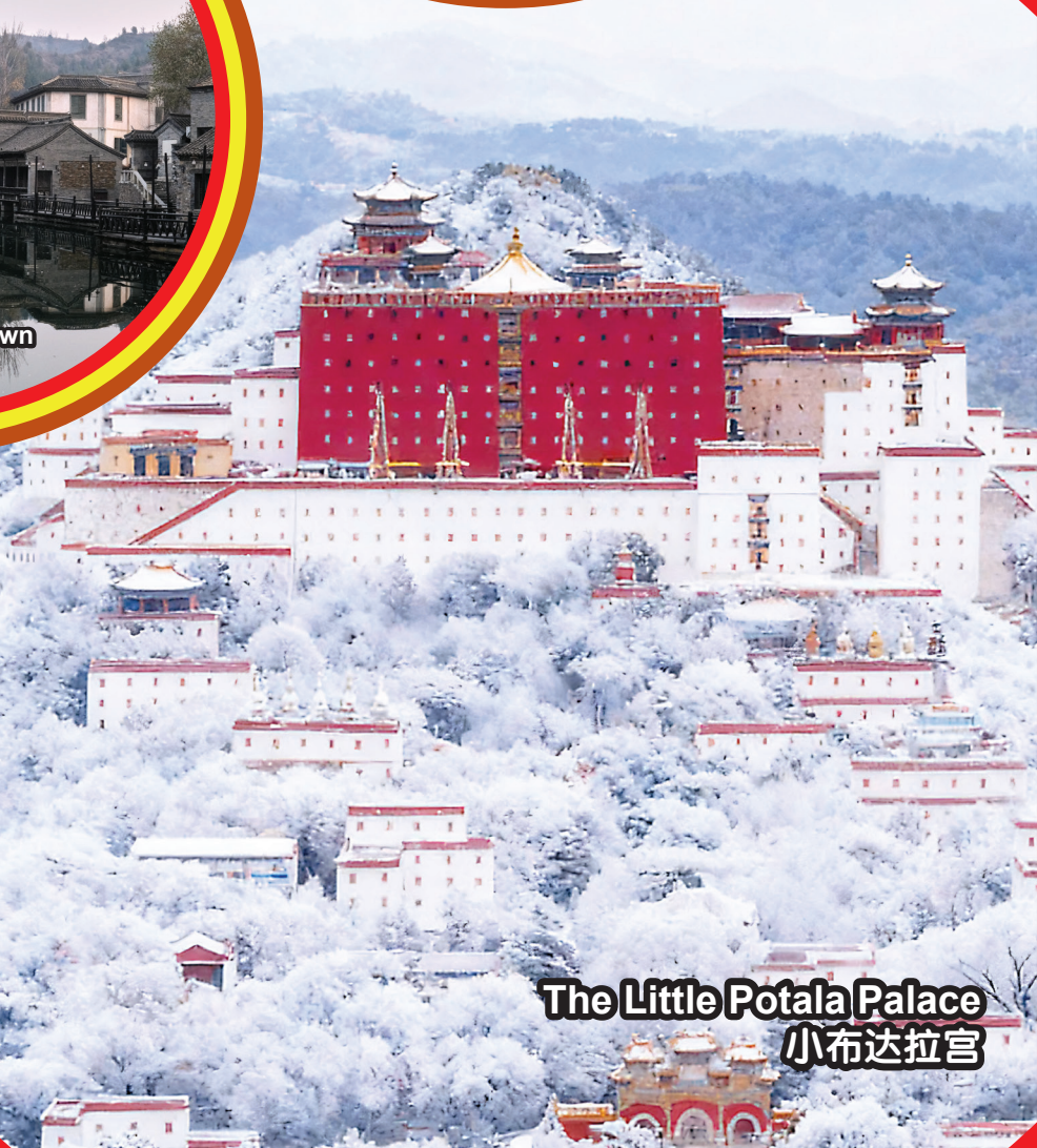
The Little Potala Palace 小布达拉宫