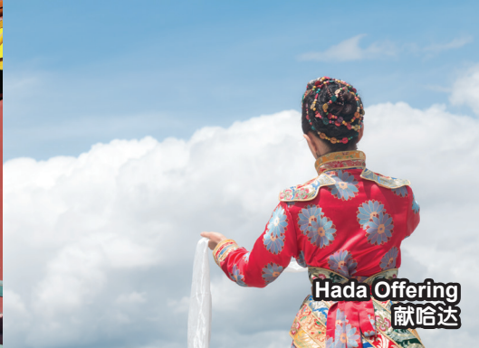
Hada Offering 献哈达