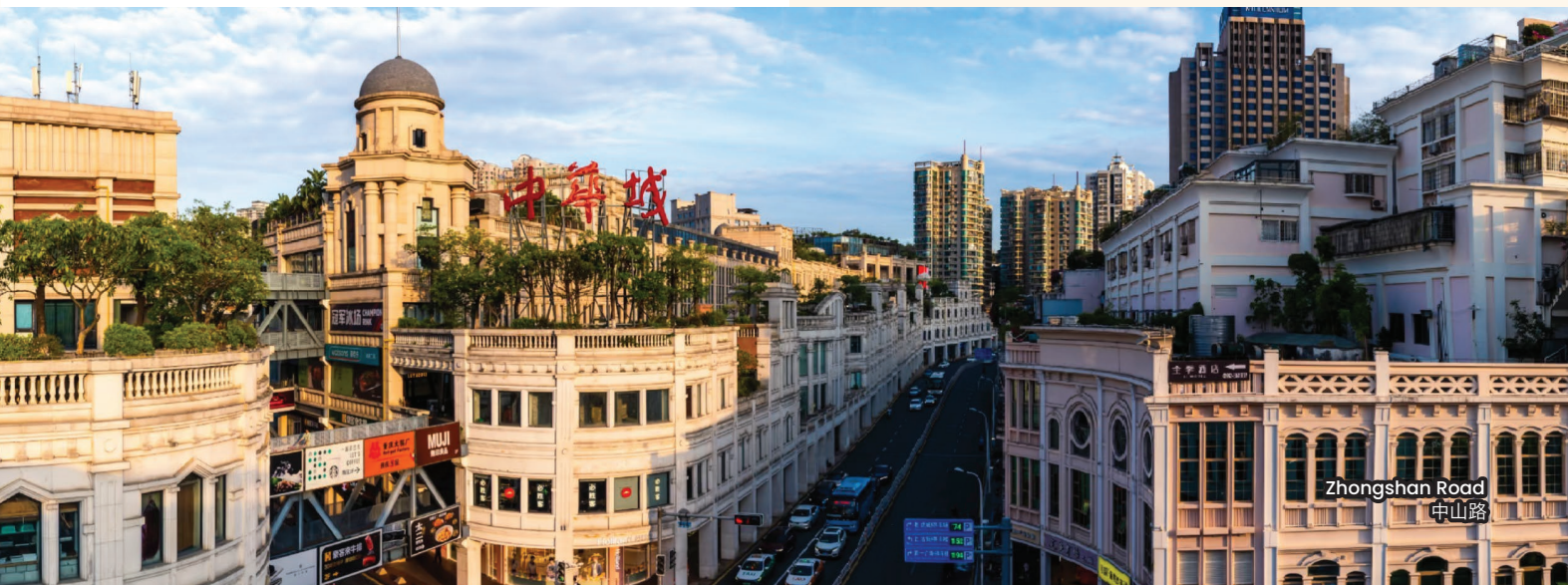
Zhongshan Road 中山路

行程次序以当地旅行社安排为准。行程，膳食，住宿，交通等可能会因不可抗拒因素而更动，恕不另行通知。