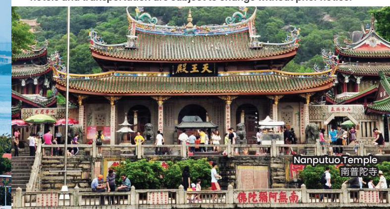
Nanputuo Temple 南普陀寺