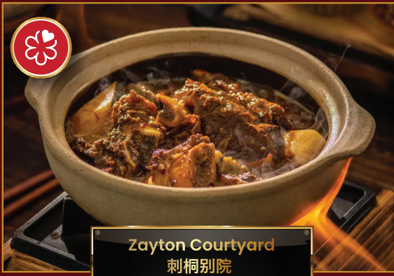
Zayton Courtyard 刺桐别院

A Minnan family-style restaurant featured in the Michelin Guide Fujian 2025. Situated adjacent to the Confucian Temple, its exterior retains the architectural style of traditional red-brick Min houses, while the interior features floral tiles and black rosewood furnishings, embodying quintessential Minnan character. Among these is the richly ginger-infused ginger duck, its sauce sweet and mellow, the duck meat thoroughly flavoured yet tender and succulent, cooked to perfection.