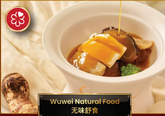
Wuwei Natural Food 无味舒食

于2025年被列入《米其林指南》里被列为“必比登推荐 (Bib Gourmand)”餐厅。同安是厦门历史文化的源头，餐厅以此命名，寓意着传承和发扬本地传统菜系。老板出生于捕鱼世家，对本地食材渔获有深厚认识。