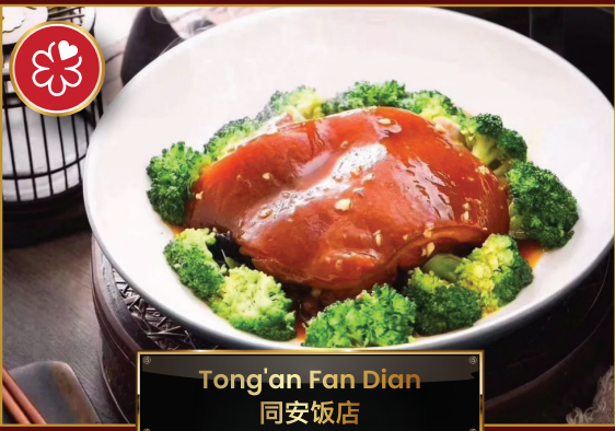
Tong'an Fan Dian 同安饭店

2025 年入选《米其林指南·福建》的闽南传家菜餐厅。餐厅紧邻府文庙，外观沿袭红砖古厝的建筑风格，内部搭配花砖与黑桃木，颇具闽南特色。菜单亦以传统菜肴为主打。当中包括姜香浓郁的姜母鸭，酱汁甜润，鸭肉充分入味却软嫩不柴，火候掌握得恰到好处。