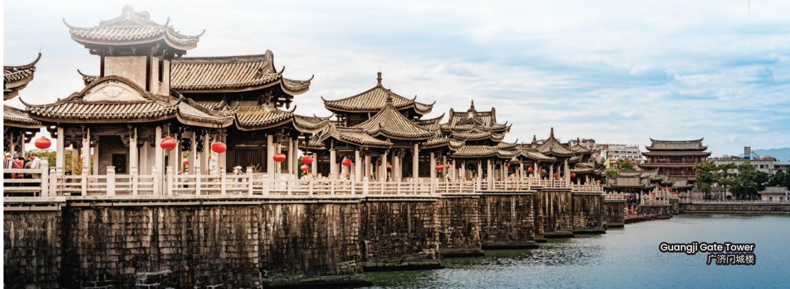
Guangji Gate Tower 广济门城楼