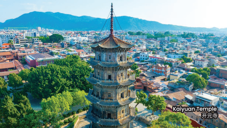
Kaiyuan Temple 开元寺