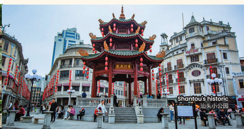
Shantou's historic 汕头小公园