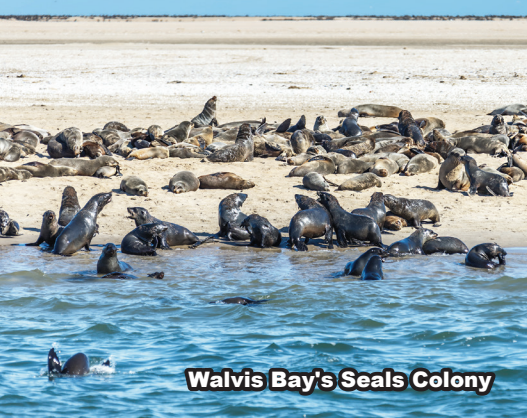
Walvis Bay's Seals Colony