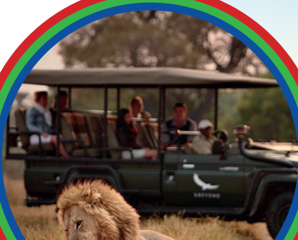
Zambeloni Game Reserve