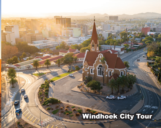
Windhoek City Tour