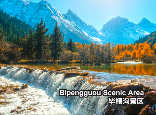
Bipengguo Scenic Area 毕棚沟景区