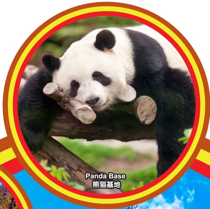
Panda Base 熊猫基地