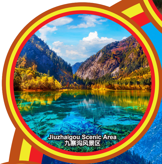
Jiuzhaigou Scenic Area 九寨沟风景区