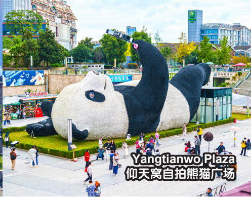
Yangtianwo Plaza 仰天窝自拍熊猫广场