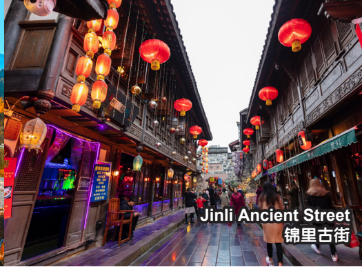
Jinli Ancient Street 锦里古街