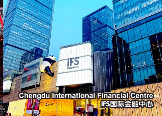
Chengdu International Financial Centre IFS国际金融中心