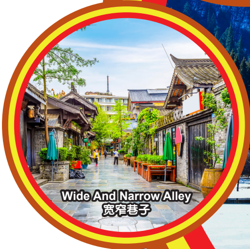
Wide And Narrow Alley 宽窄巷子

行程次序，以当地旅社安排为准。 Sequences of Itinerary are subject to local arrangement.