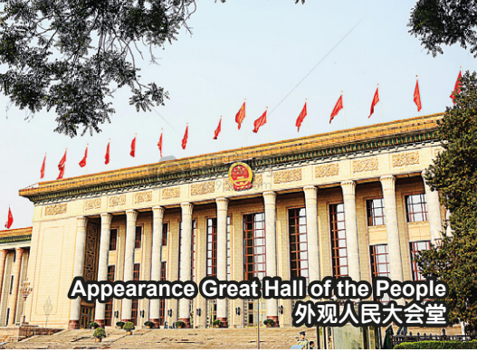
Appearance Great Hall of the People 外观人民大会堂