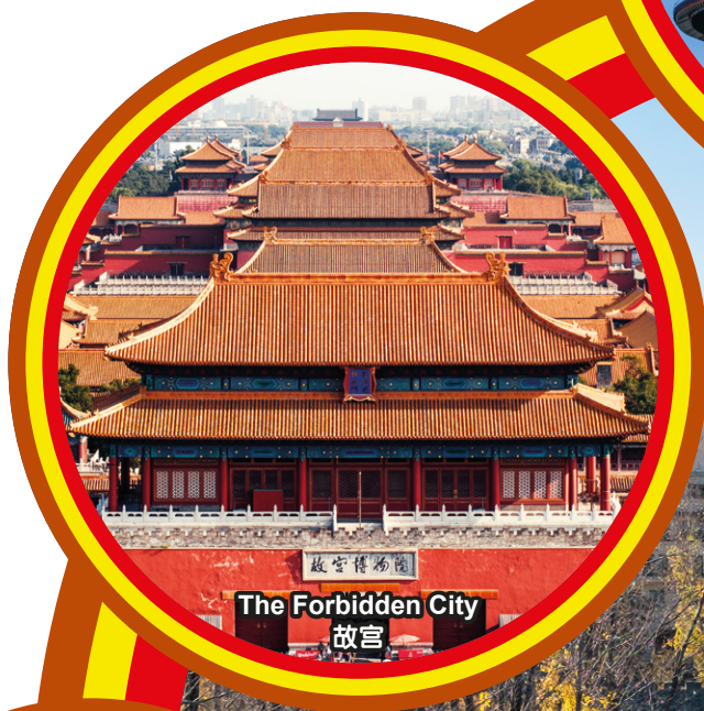
The Forbidden City 故宫