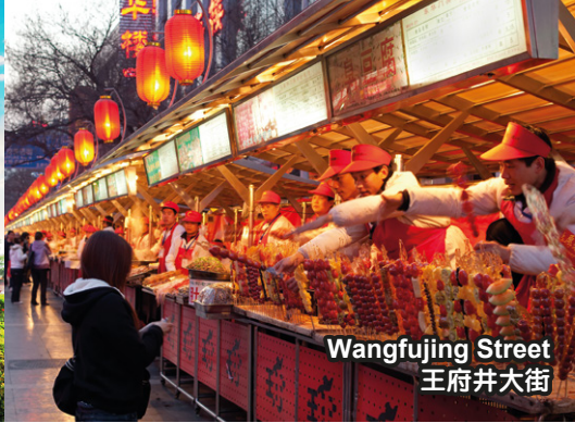
Wangfujing Street 王府井大街