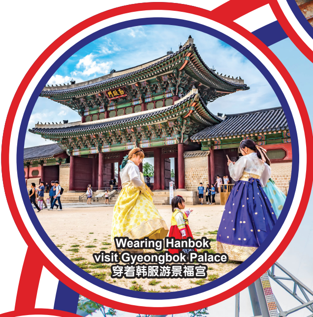
Wearing Hanbok visit Gyeongbok Palace 穿着韩服游景福宫