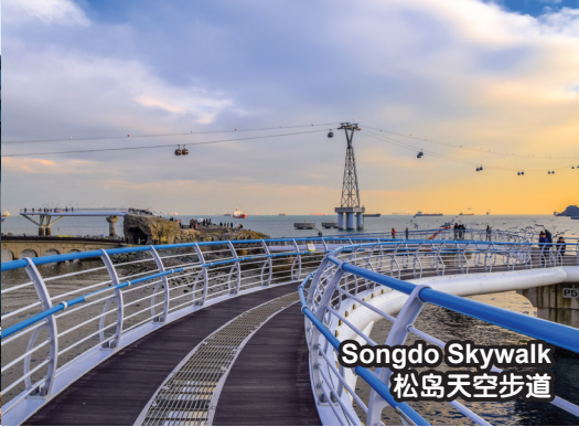
Songdo Skywalk 松岛天空步道