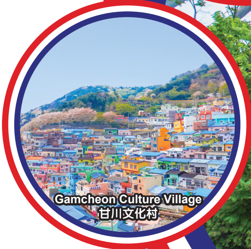
Gamcheon Culture Village 甘川文化村