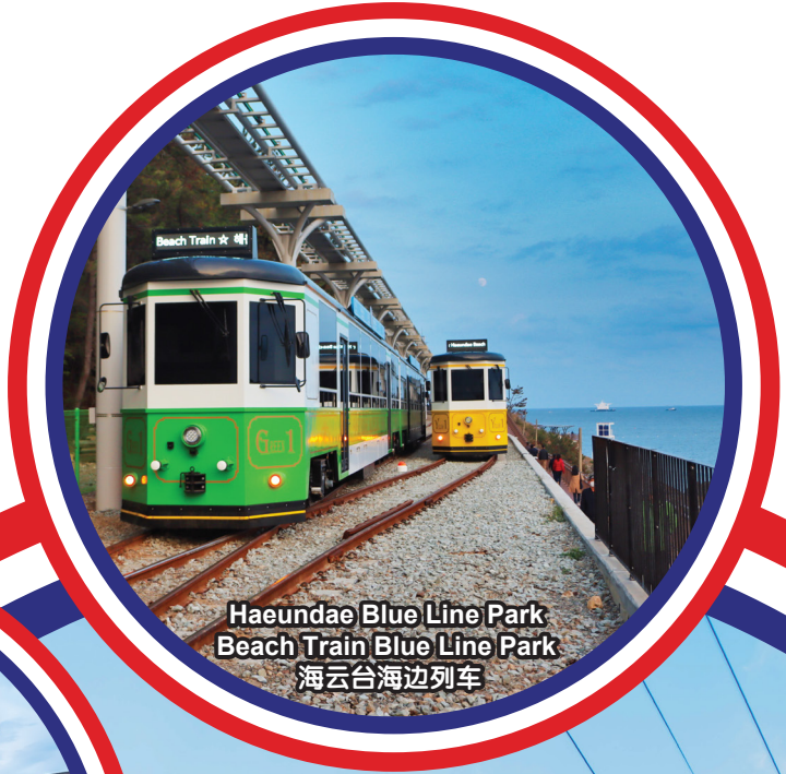
Haeundae Blue Line Park Beach Train Blue Line Park 海云台海边列车