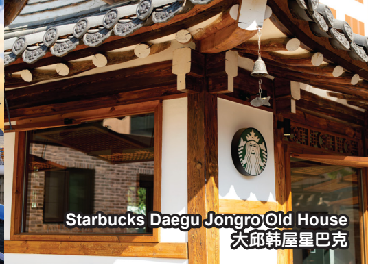
Starbucks Daegu Jongro Old House 大邱韩屋星巴克