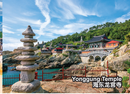
Yonggung Temple 海东龙宫寺