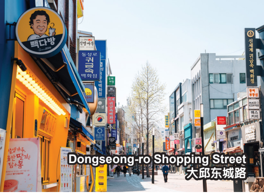
Dongseong-ro Shopping Street 大邱东城路