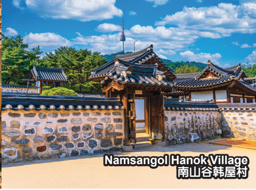
Namsangol Hanok Village 南山谷韩屋村