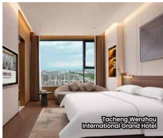
Tacheng Wenzhou International Grand Hotel