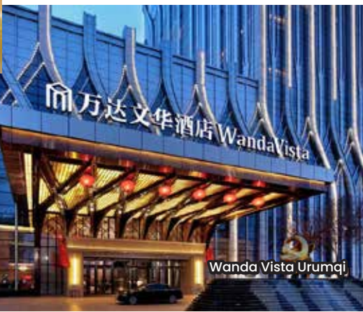
Wanda Vista Urumqi