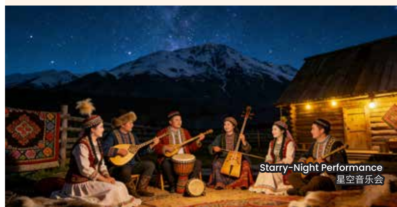
Starry-Night Performance 星空音乐会

Sequences of itinerary are subject to local arrangement. Itineraries, meals, hotels and transportation are subject to change without prior notice.