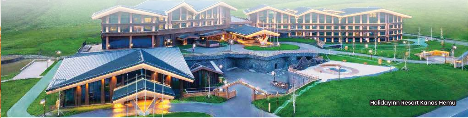
HolidayInn Resort Kanas Hemu

Embark on a complete journey at 4-star & 5-star hotel, offering a quality & comfortable stay. 全程安排四+五星级酒店, 让您在整个旅程中享受到有质量且舒适的住宿环境。