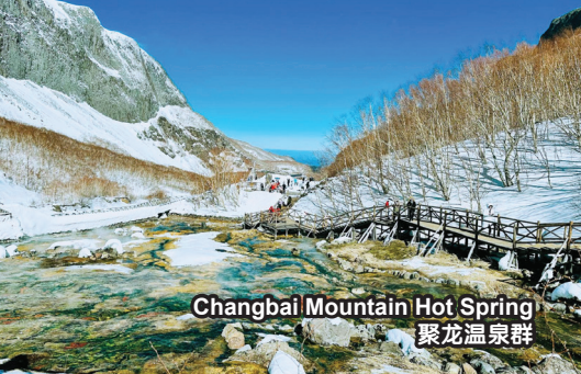
Changbai Mountain Hot Spring 聚龙温泉群