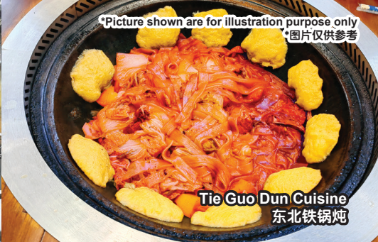
Tie Guo Dun Cuisine 东北铁锅炖

*Picture shown are for illustration purpose only *图片仅供参考