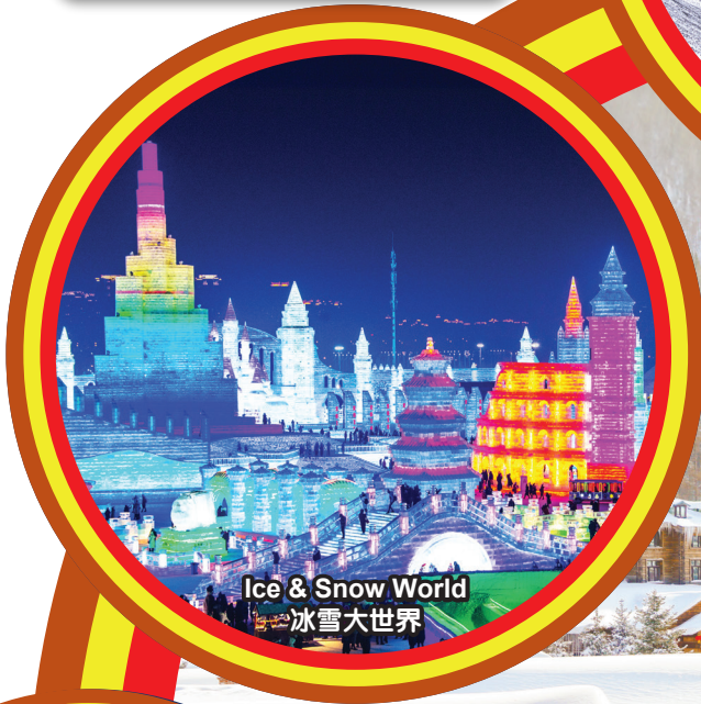
Ice & Snow World 冰雪大世界