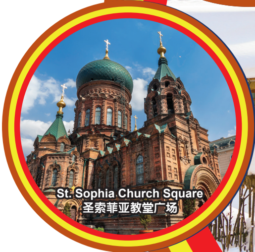
St. Sophia Church Square 圣索菲亚教堂广场

*All Pictures shown are for illustration purpose only *图片仅供参考