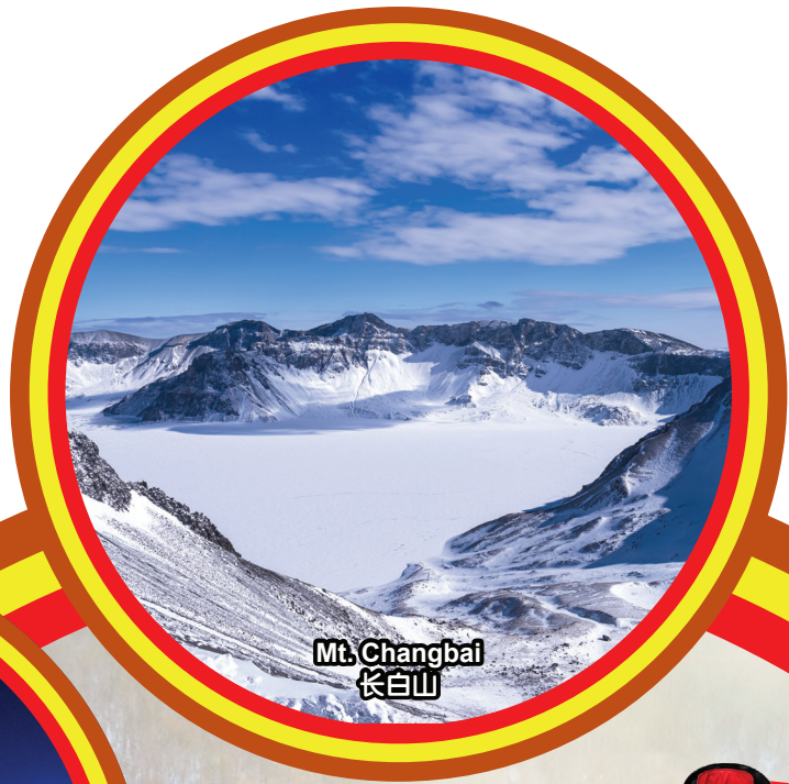
Mt. Changbai 长白山