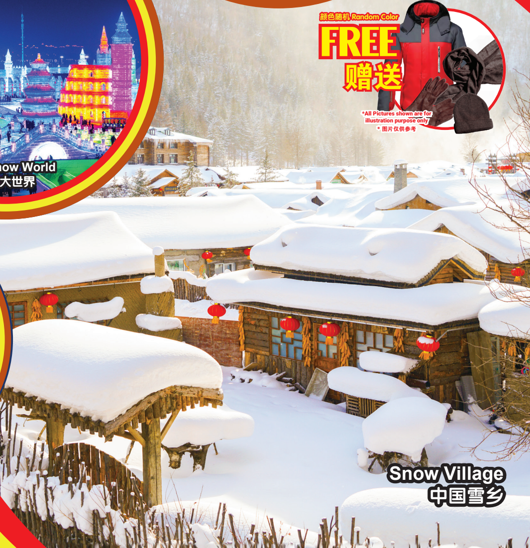
Snow Village 中国雪乡

行程次序, 以当地旅社安排为准。 Sequences of Itinerary are subject to local arrangement.