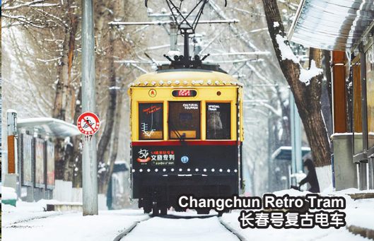
Changchun Retro Tram 长春号复古电车