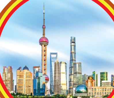
The Bund 上海外滩