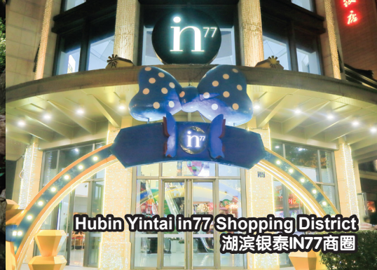
Hubin Yintai in77 Shopping District 湖滨银泰in77商圈