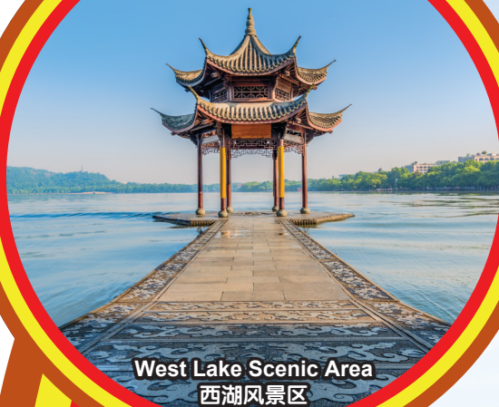
West Lake Scenic Area 西湖风景区