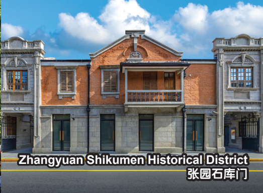
Zhangyuan Shikumen Historical District 张园石库门