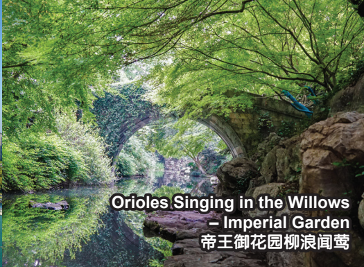
Orioles Singing in the Willows - Imperial Garden 帝王御花园柳浪闻莺