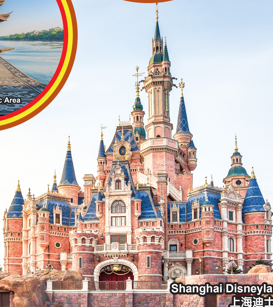
Shanghai Disneyland 上海迪士尼

行程次序，以當地旅社安排為準。 Sequences of Itinerary are subject to local arrangement.