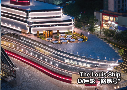
The Louis Ship LV巨轮“路易号”