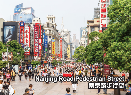
Nanjing Road Pedestrian Street 南京路步行街