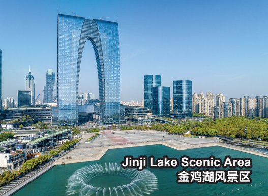
Jinji Lake Scenic Area 金鸡湖风景区