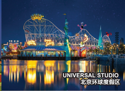
UNIVERSAL STUDIO 北京环球度假区