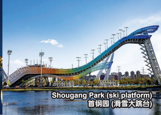
Shougang Park (ski platform) 首钢园 (滑雪大跳台)