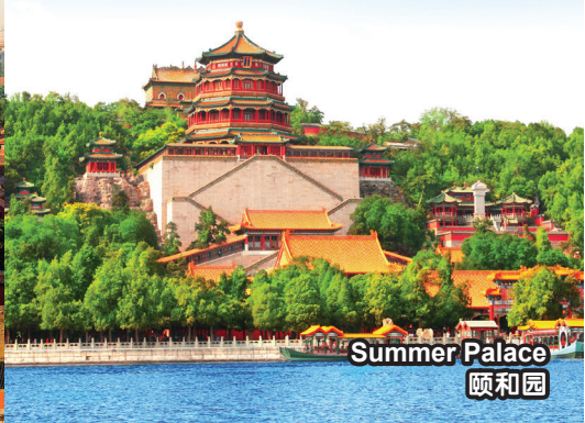
Summer Palace 颐和园