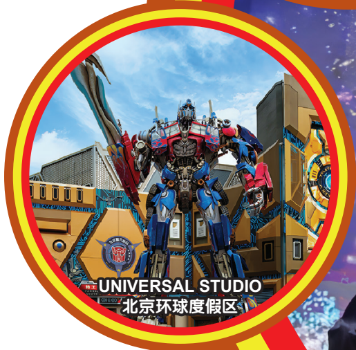
UNIVERSAL STUDIO 北京环球度假区

行程次序，以当地旅社安排为准。 Sequences of Itinerary are subject to local arrangement.