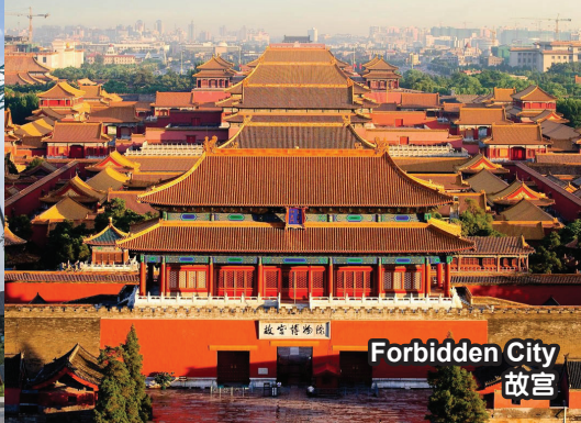
Forbidden City 故宫