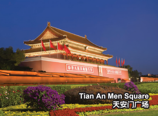
Tian An Men Square 天安门广场