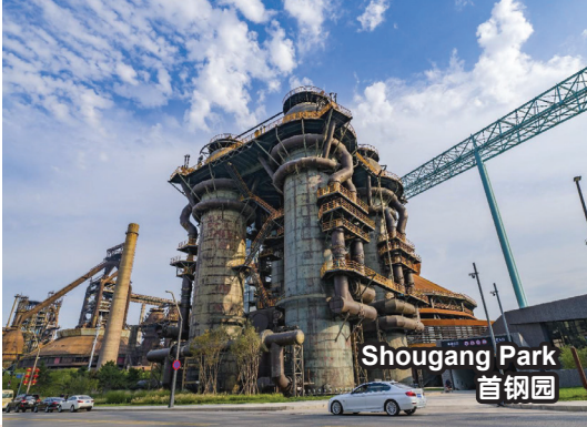
Shougang Park 首钢园