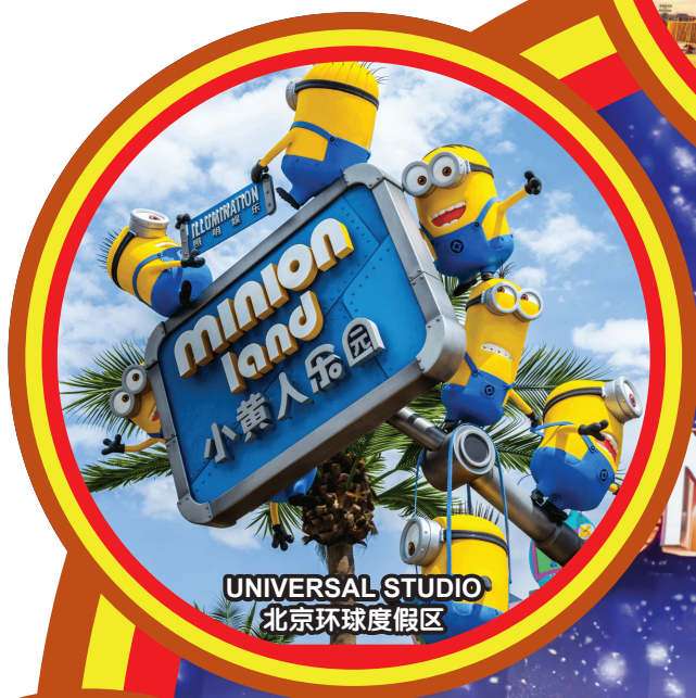
UNIVERSAL STUDIO 北京环球度假区