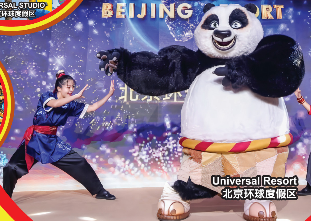
Universal Resort 北京环球度假区