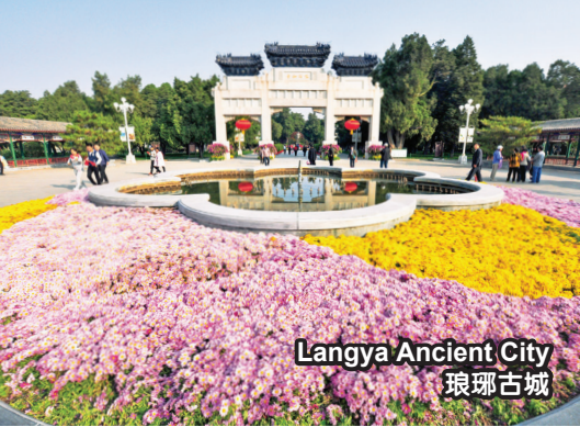
Langya Ancient City 琅琊古城