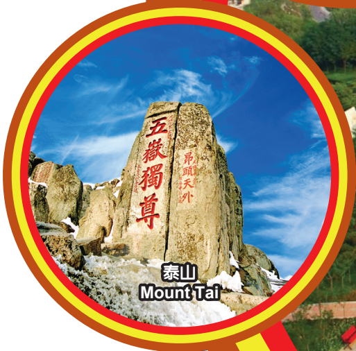
泰山 Mount Tai