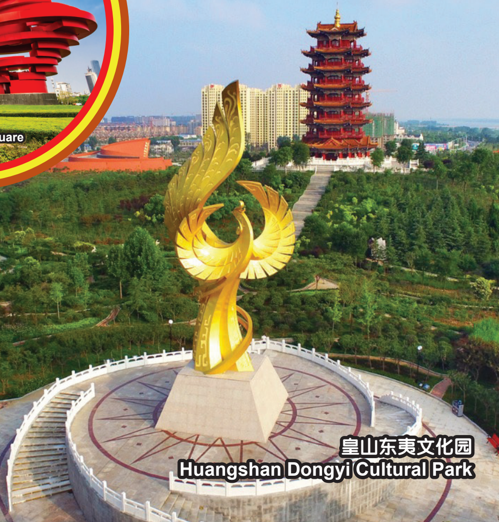
皇山东夷文化园 Huangshan Dongyi Cultural Park

行程次序，以当地旅社安排为准。 Sequences of Itinerary are subject to local arrangement.