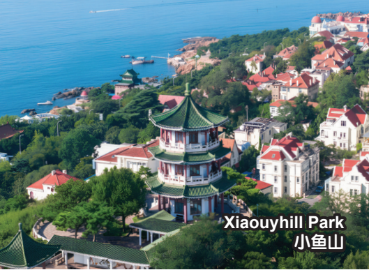
Xiaoyu Hill Park 小鱼山