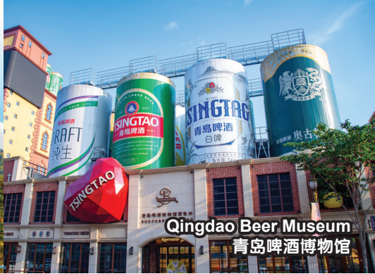
Qingdao Beer Museum 青岛啤酒博物馆