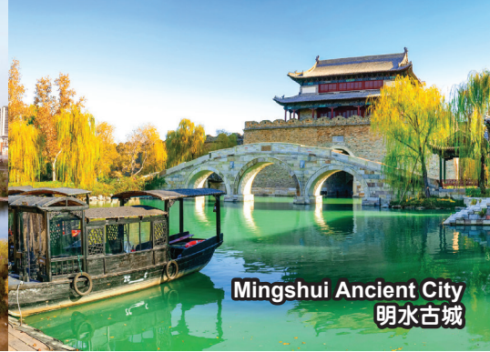
Mingshui Ancient City 明水古城