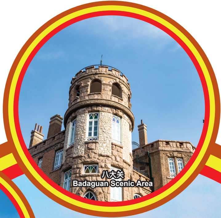
八大关 Badaguan Scenic Area