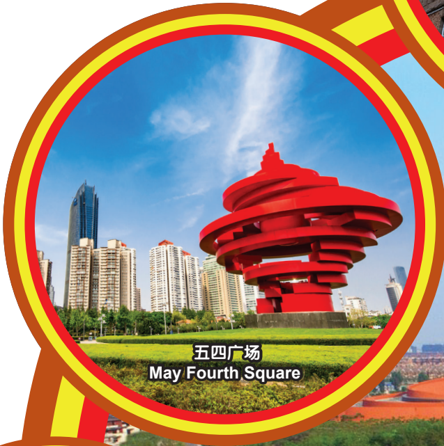
五四广场 May Fourth Square