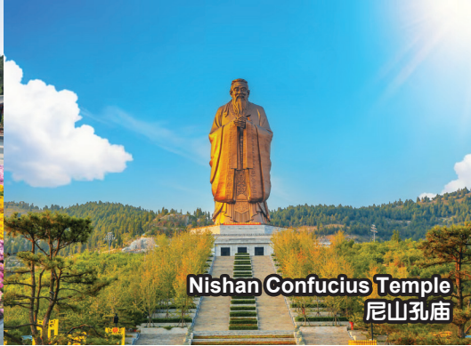
Nishan Confucius Temple 尼山孔庙