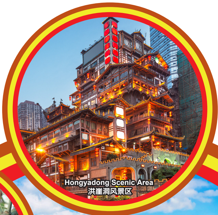
Hongyadong Scenic Area 洪崖洞风景区