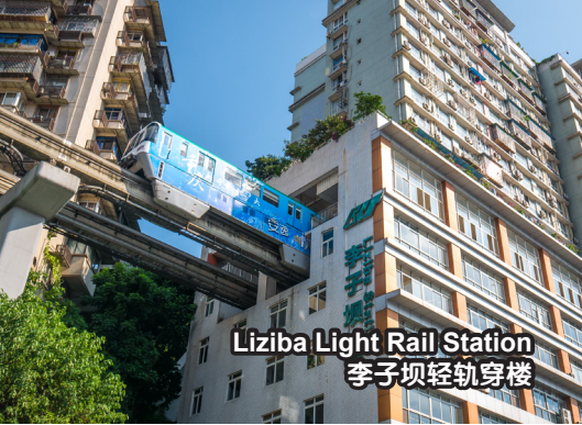
Liziba Light Rail Station 李子坝轻轨穿楼