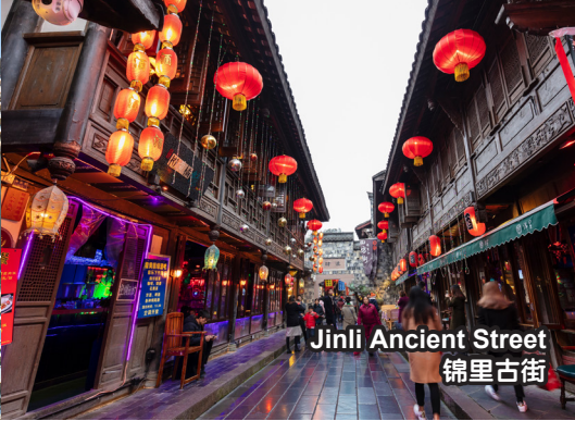
Jinli Ancient Street 锦里古街