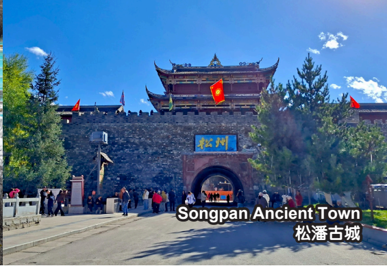
Songpan Ancient Town 松潘古城