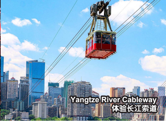
Yangtze River Cableway 体验长江索道