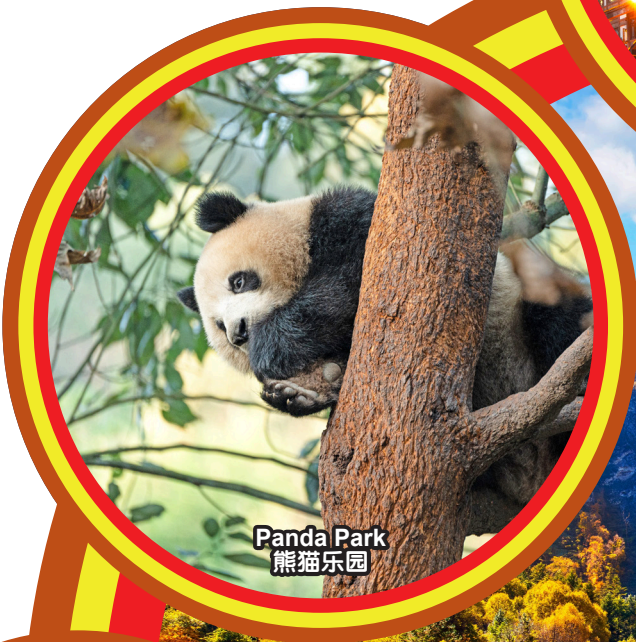
Panda Park 熊猫乐园