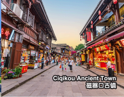
Ciqikou Ancient Town 磁器口古镇