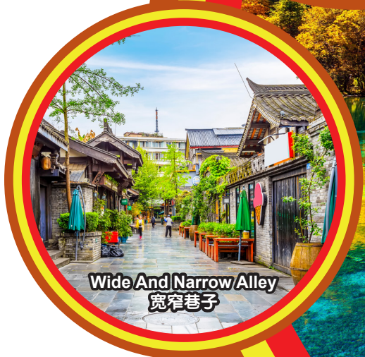
Wide And Narrow Alley 宽窄巷子