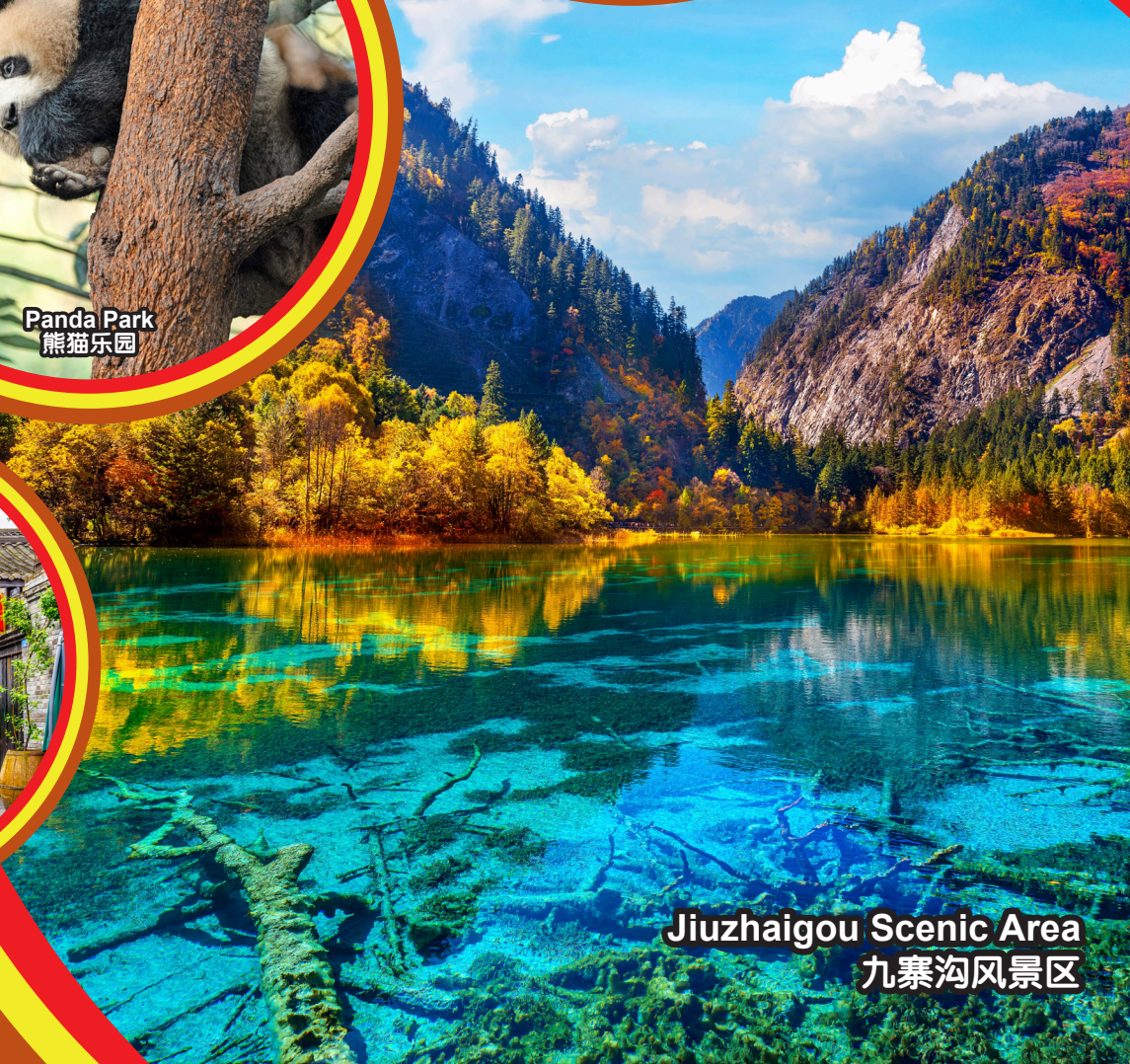
Jiuzhaigou Scenic Area 九寨沟风景区

行程次序，以当地旅社安排为准。 Sequences of Itinerary are subject to local arrangement.