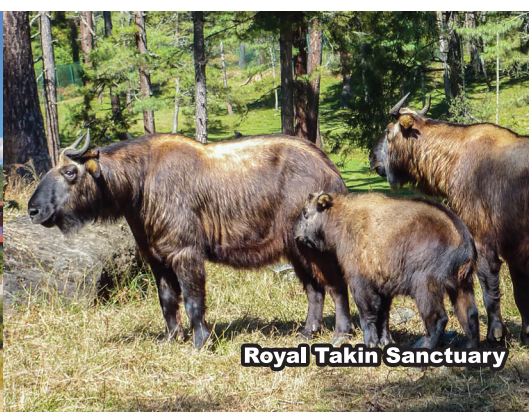
Royal Takin Sanctuary