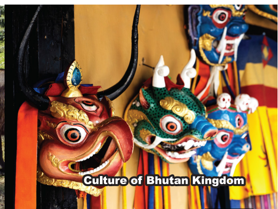
Culture of Bhutan Kingdom