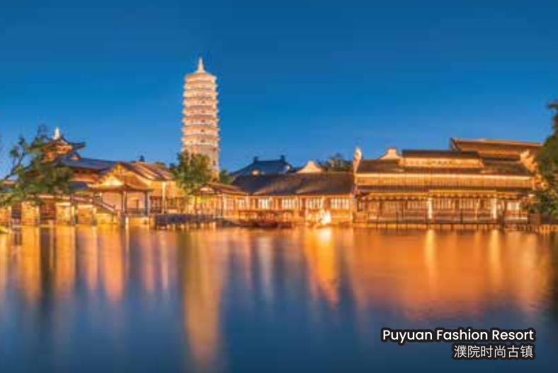
Puyuan Fashion Resort 濮院时尚古镇