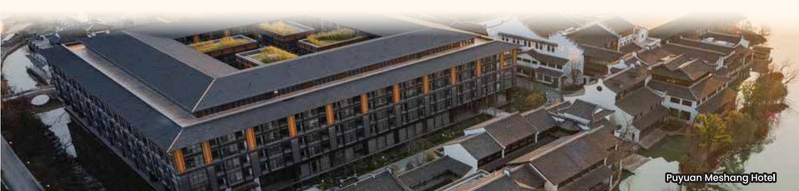
Puyuan Meshang Hotel