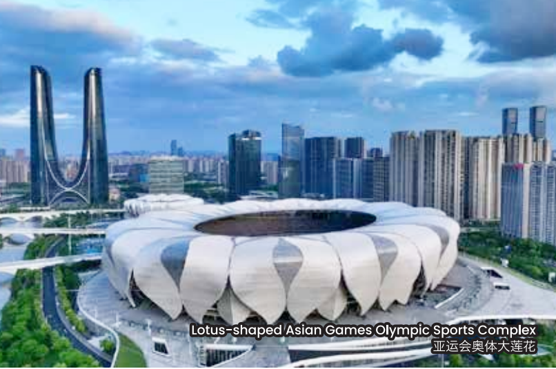
Lotus-shaped Asian Games Olympic Sports Complex 亚运会奥体大莲花