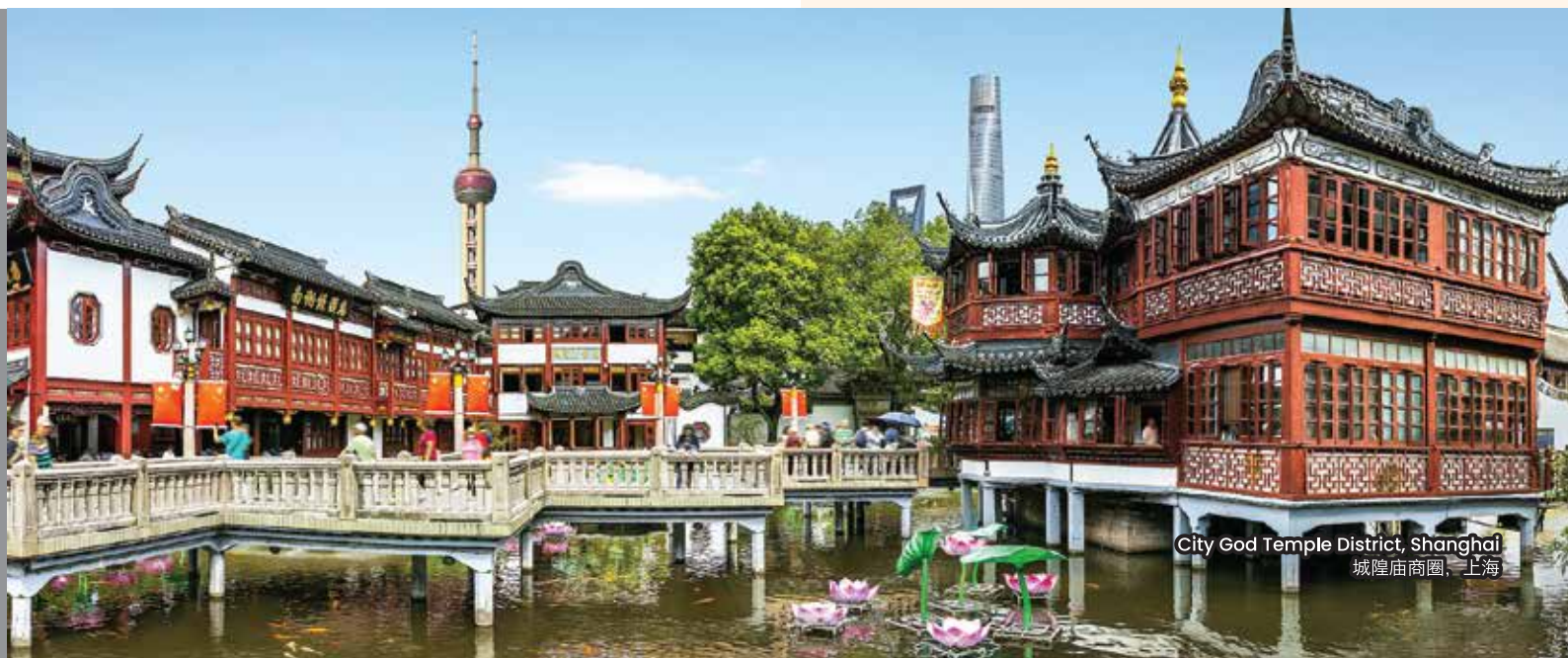
City God Temple District, Shanghai 城隍庙商圈, 上海

Sequences of itinerary are subject to local arrangement. Itineraries, meals, hotels and transportation are subject to change without prior notice.