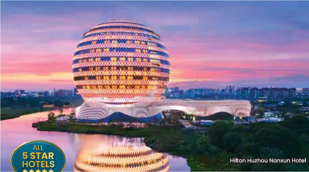
Hilton Huzhou Nanyun Hotel