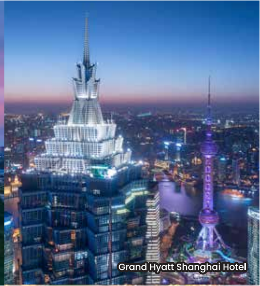
Grand Hyatt Shanghai Hotel