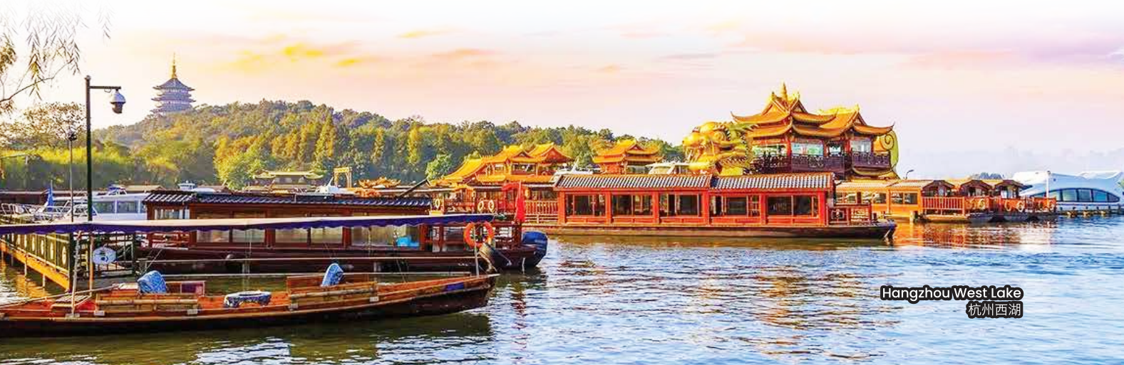
Hangzhou West Lake 杭州西湖