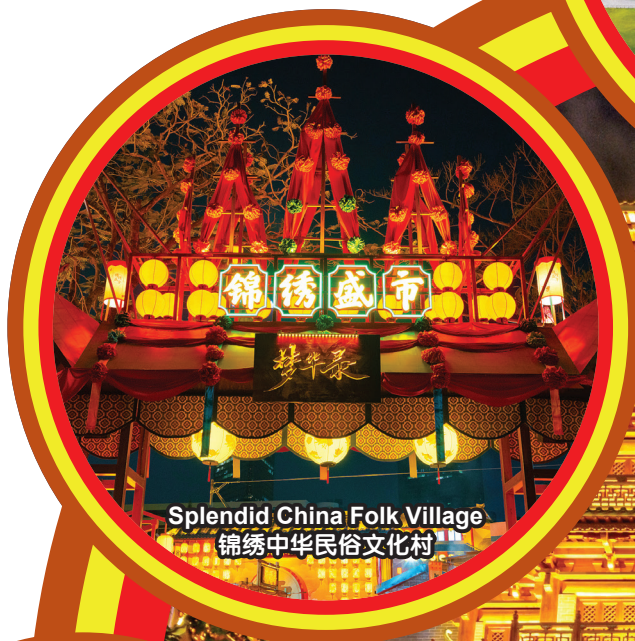
Splendid China Folk Village 锦绣中华民俗文化村