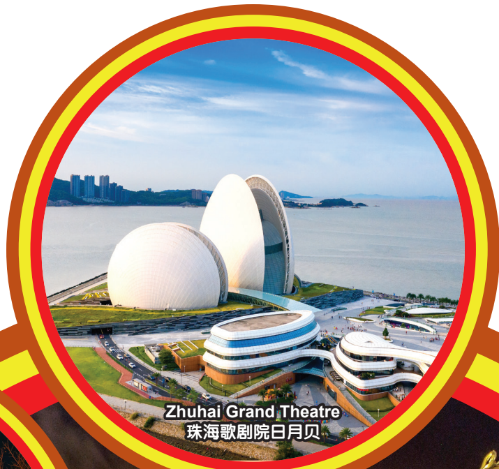
Zhuhai Grand Theatre 珠海歌剧院日月贝