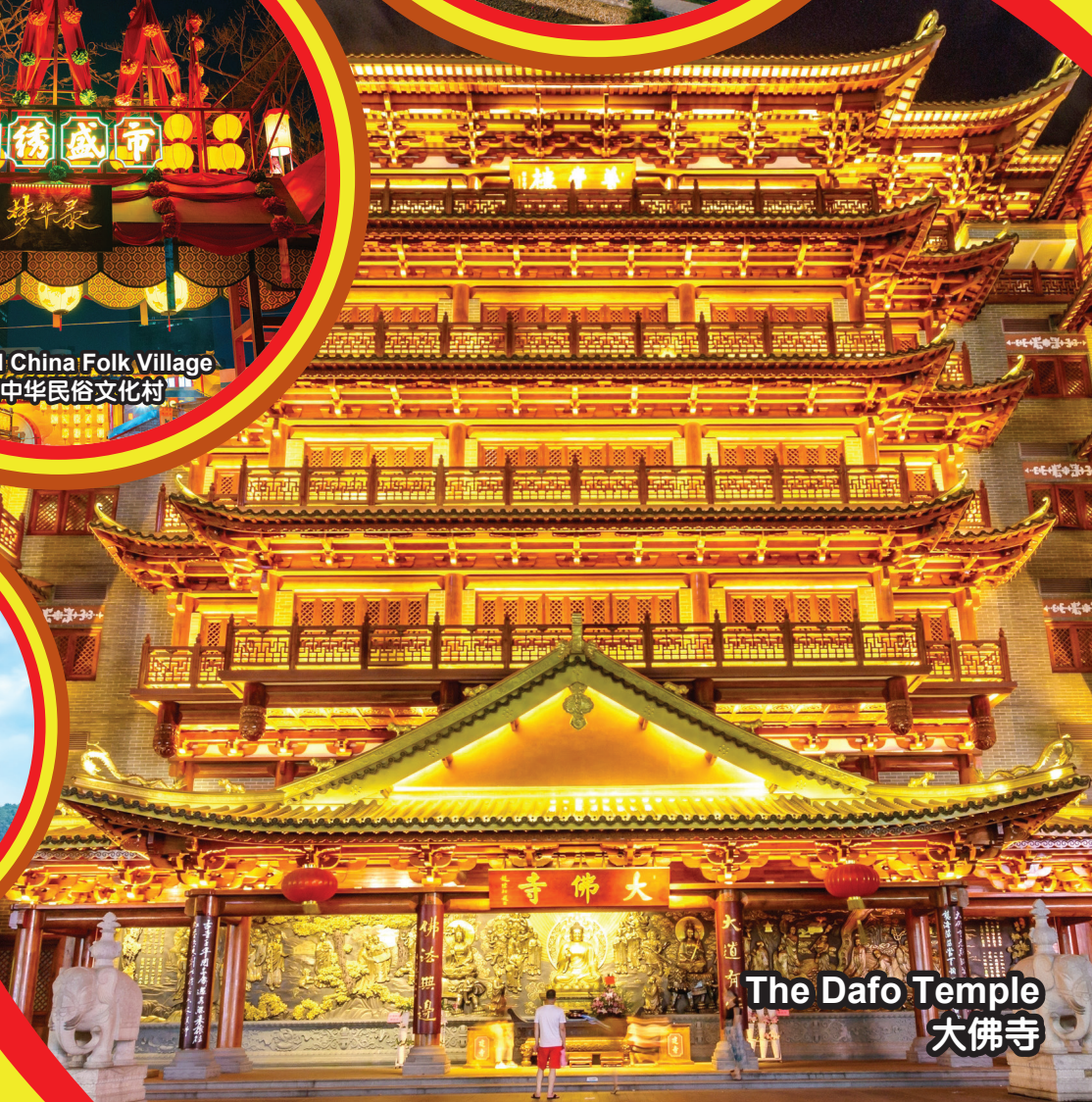
The Dafo Temple 大佛寺

行程次序，以当地旅社安排为准。 Sequences of itinerary are subject to local arrangement.