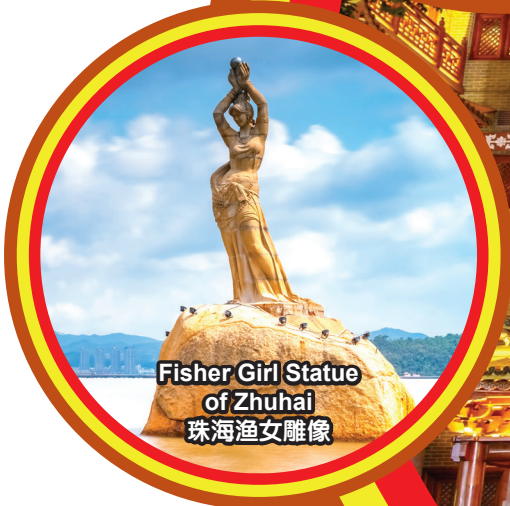
Fisher Girl Statue of Zhuhai 珠海渔女雕像