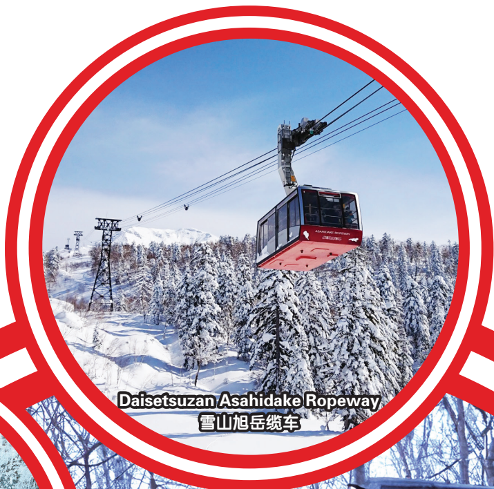
Daisetsuzan Asahidake Ropeway 雪山旭岳缆车