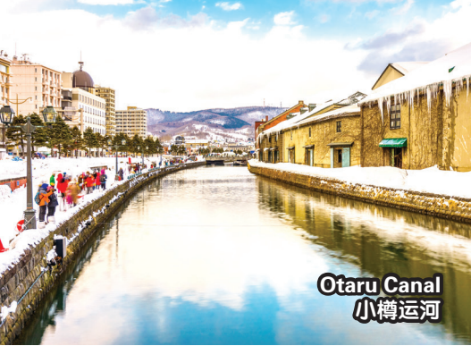
Otaru Canal 小樽运河