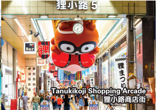
Tanukikoji Shopping Arcade 狸小路商店街