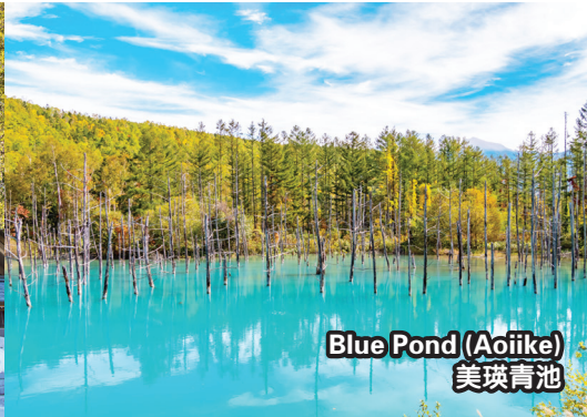
Blue Pond (Aoiike) 美瑛青池