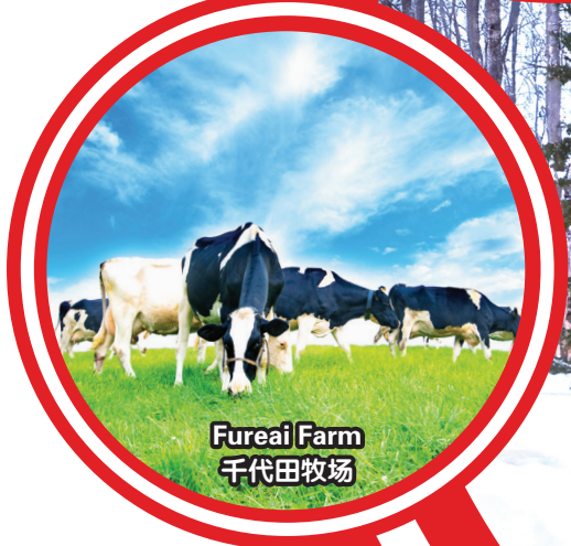
Fureai Farm 千代田牧场