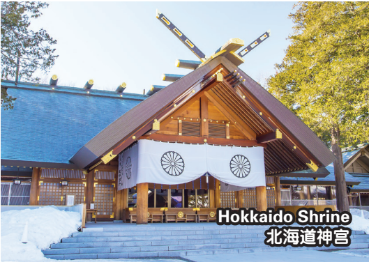
Hokkaido Shrine 北海道神宮