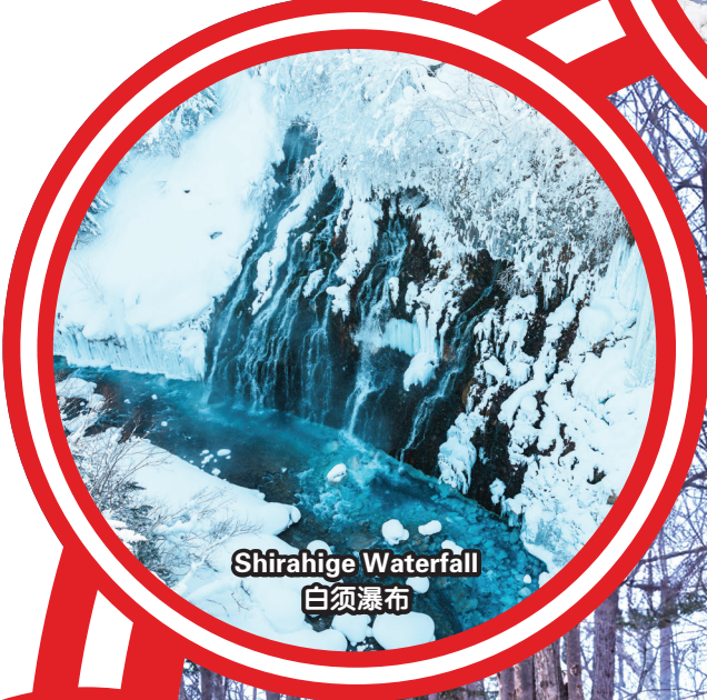
Shirahige Waterfall 白须瀑布