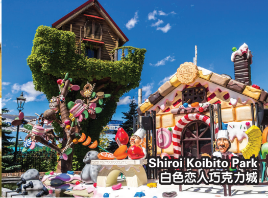
Shiroi Koibito Park 白色恋人巧克力城