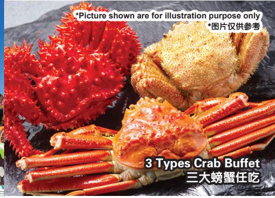
3 Types Crab Buffet 三大螃蟹任吃

*Picture shown are for illustration purpose only *图片仅供参考