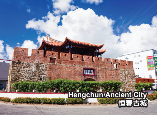
Hengchun Ancient City 恒春古城