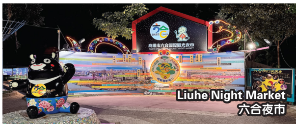
Liuhe Night Market 六合夜市

Disclaimer: Golden Destinations reserved the right to alter the sequence or change, amend or alter the itinerary if necessary, with or without prior notice.