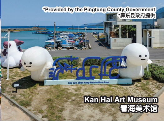
Kan Hai Art Museum 看海美术馆