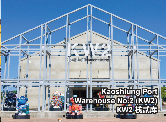
Kaoshiung Port Warehouse No.2 (KW2) KW2 棧貳庫