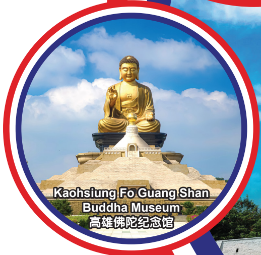
Kaohsiung Fo Guang Shan Buddha Museum 高雄佛陀纪念馆