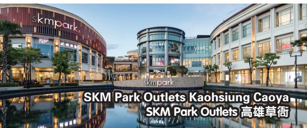
SKM Park Outlets Kaohsiung Caoya SKM Park Outlets 高雄草衙

免责声明: 必要时黄金旅程保留对行程进行适当调整 (调整景点游览顺序) 以确保行程顺利进行, 会或否事先通知。 备注: 如果旅游行程受到上述问题的影响, 将不予退款或更换。图片仅供参考。