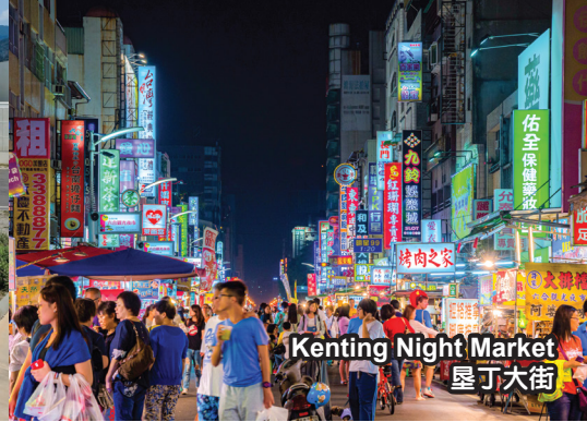
Kenting Night Market 垦丁大街