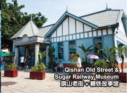
Qishan Old Street & Sugar Railway Museum 旗山老街 + 糖铁故事馆