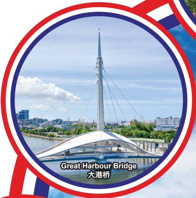
Great Harbour Bridge 大港桥