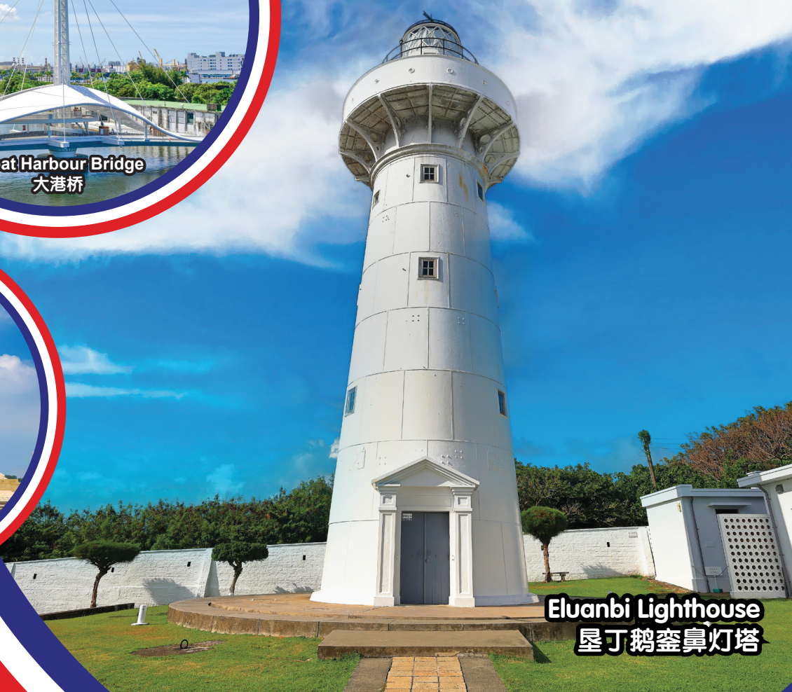
Eluanbi Lighthouse 垦丁鹅銮鼻灯塔

行程次序，以当地旅社安排为准。 Sequences of Itinerary are subject to local arrangement.