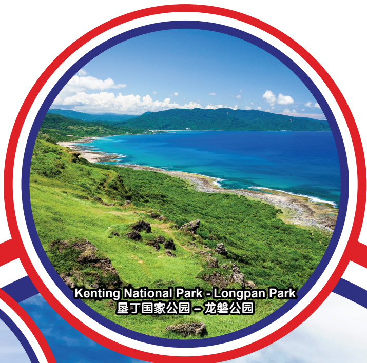
Kenting National Park - Longpan Park 垦丁国家公园 - 龙磐公园