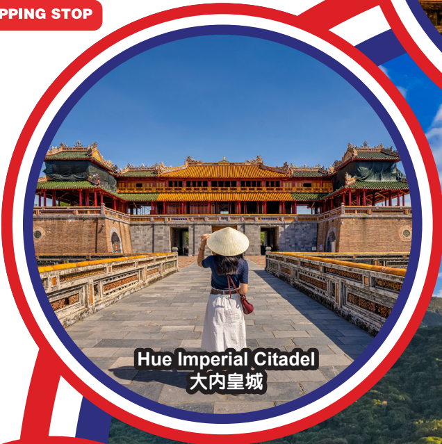
Hue Imperial Citadel 大内皇城