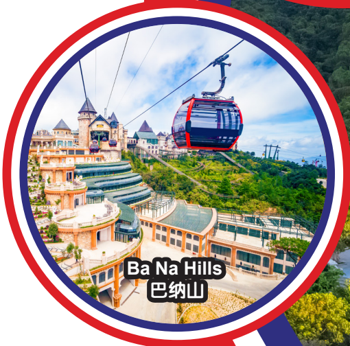
Ba Na Hills 巴纳山