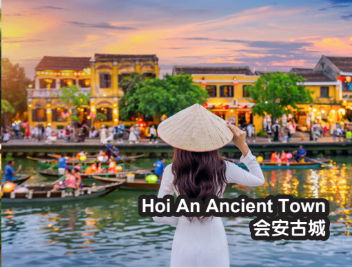
Hoi An Ancient Town 会安古城