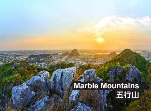
Marble Mountains 五行山