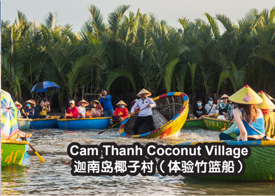
Cam Thanh Coconut Village 迦南岛椰子村 (体验竹篮船)