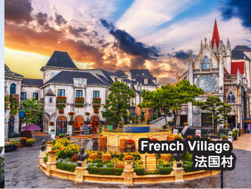
French Village 法国村