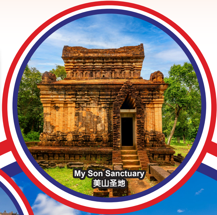
My Son Sanctuary 美山圣地