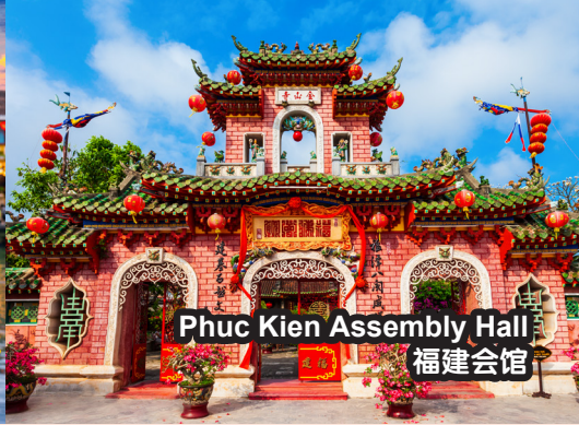
Phuc Kien Assembly Hall 福建会馆