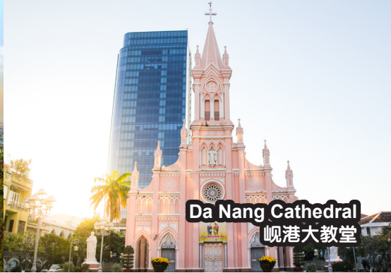
Da Nang Cathedral 岷港大教堂