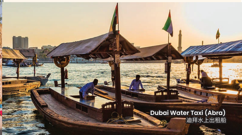
Dubai Water Taxi (Abra) 迪拜水上出租船

行程次序以当地旅行社安排为准。行程，膳食，住宿，交通等可能会因不可抗拒因素而更动，恕不另行通知。