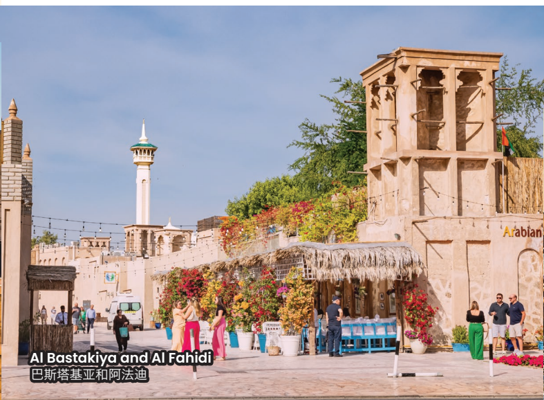
Al Bastakiya and Al Fahidi 巴斯塔基亚和阿法迪