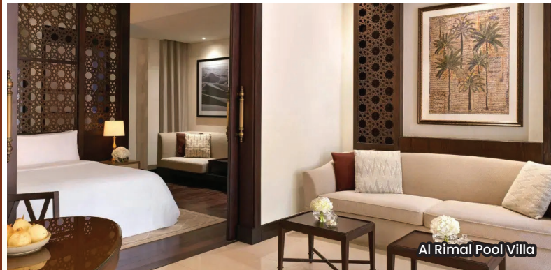
Al Rimal Pool Villa