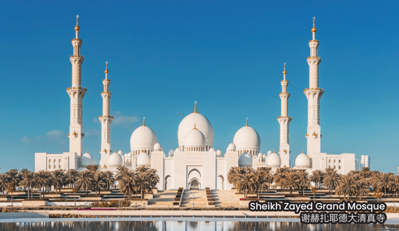
Sheikh Zayed Grand Mosque 谢赫扎耶德大清真寺