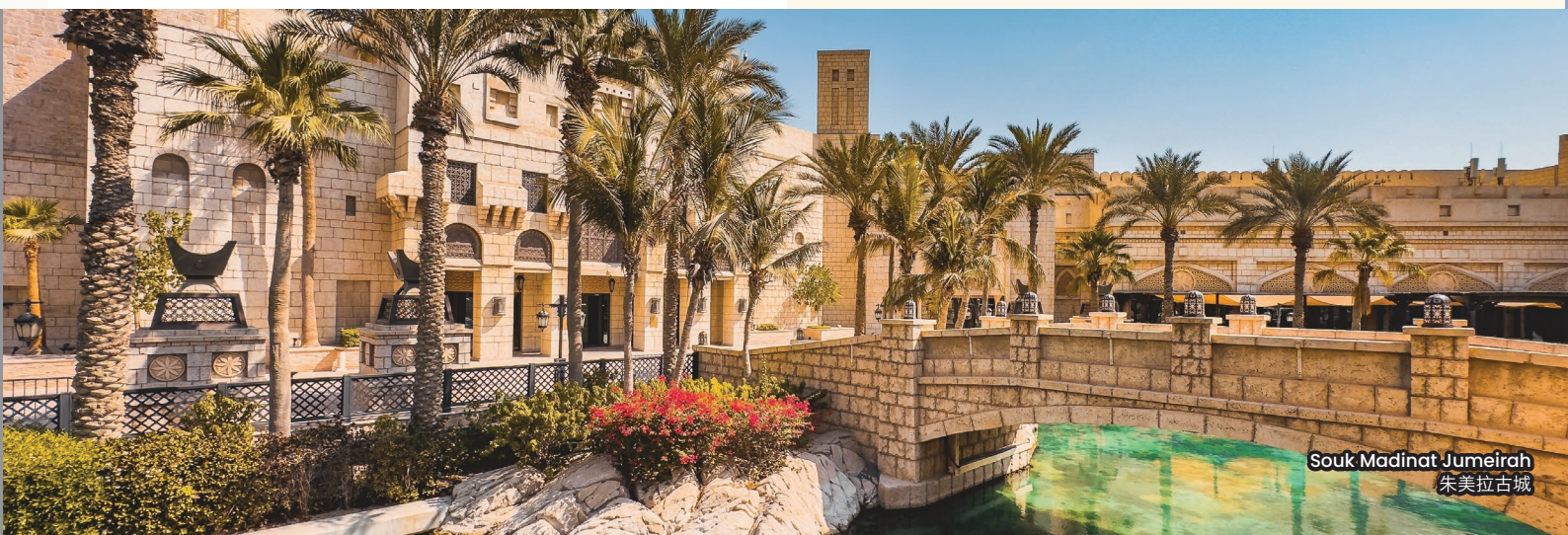
Souk Madinat Jumeirah 朱美拉古城

Sequences of itinerary are subject to local arrangement. Itineraries, meals, hotels and transportation are subject to change without prior notice.