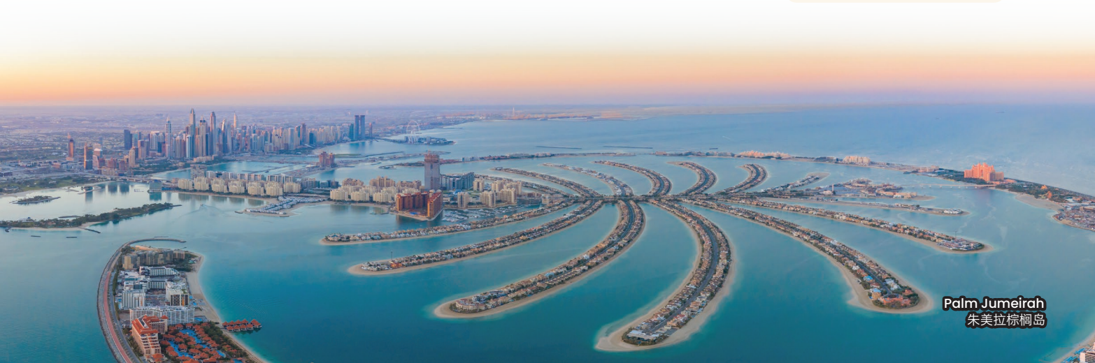
Palm Jumeirah 朱美拉棕榈岛