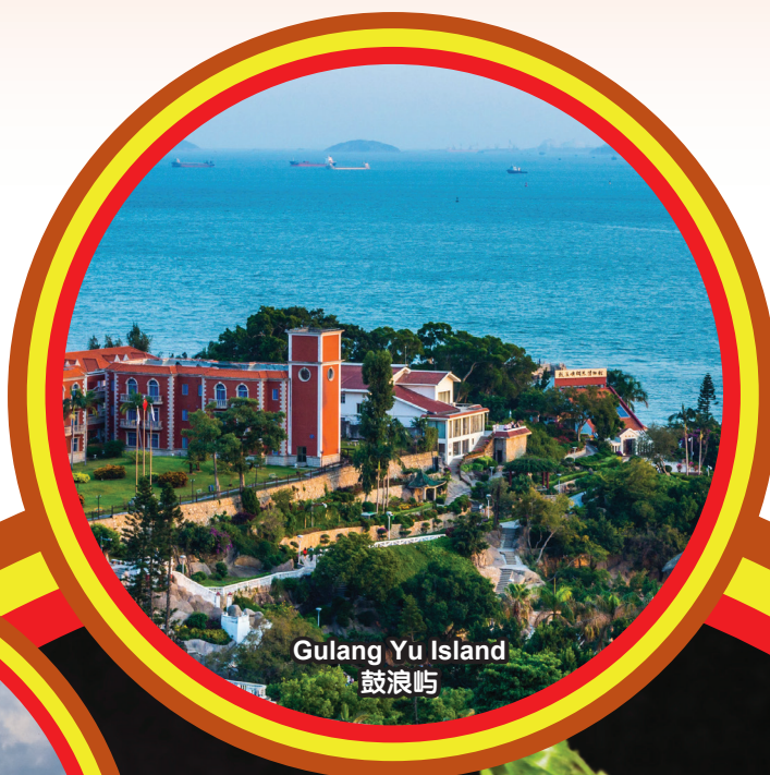
Gulang Yu Island 鼓浪屿