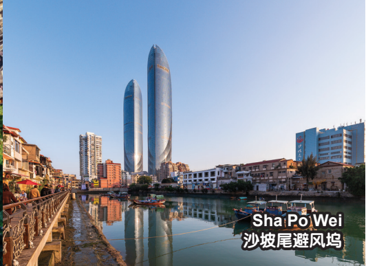
Sha Po Wei 沙坡尾避风坞