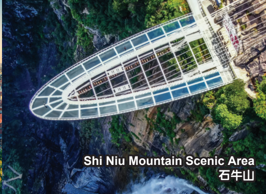
Shi Niu Mountain Scenic Area 石牛山