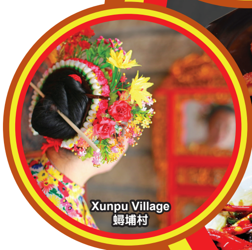
Xunpu Village 蜑埔村