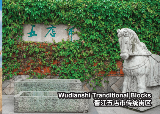
Wudianshi Traditional Blocks 晋江五店市传统街区