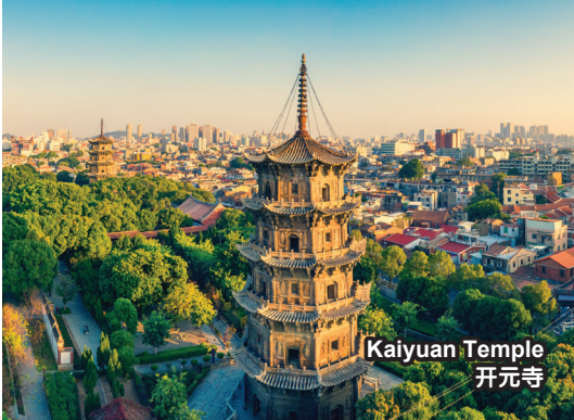
Kaiyuan Temple 开元寺