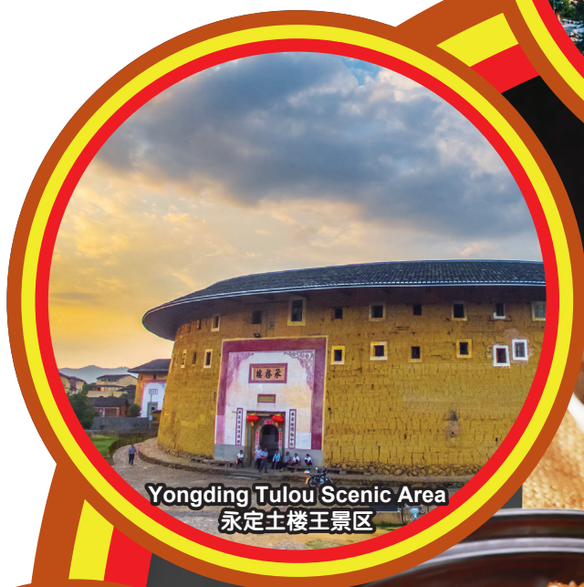
Yongding Tulou Scenic Area 永定土楼王景区