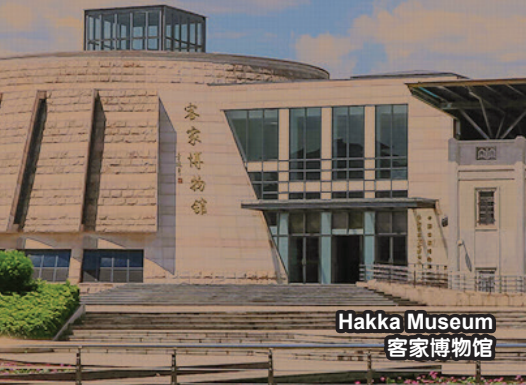
Hakka Museum 客家博物馆