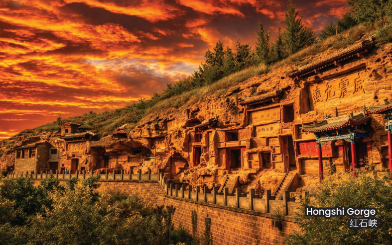
Hongshi Gorge 红石峡