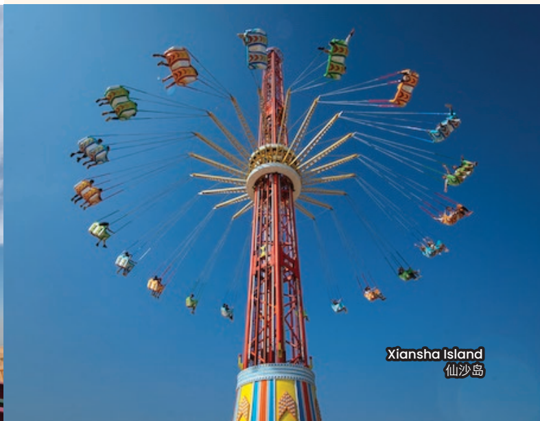
Xiansha Island 仙沙岛