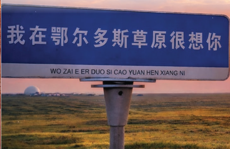
Ordos Grassland 鄂尔多斯草原