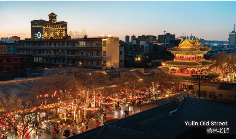
Yulin Old Street 榆林老街