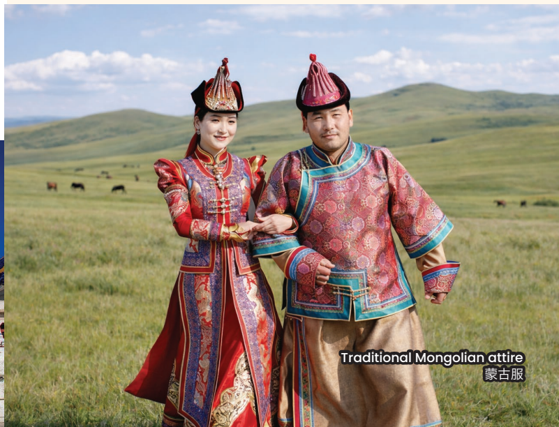
Traditional Mongolian attire 蒙古服