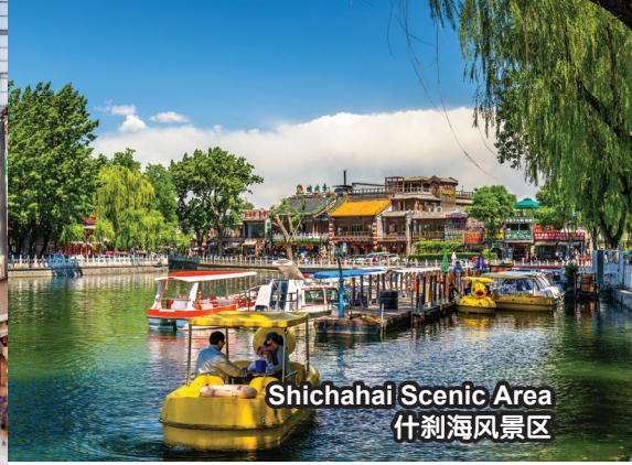
Shichahai Scenic Area 什刹海风景区