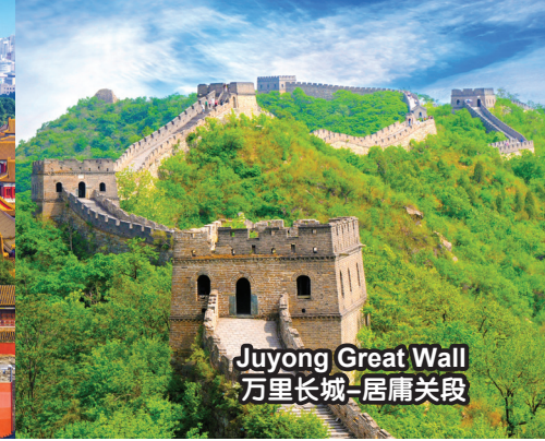
Juyong Great Wall 万里长城-居庸关段