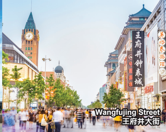
Wangfujing Street 王府井大街