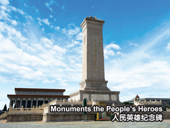
Monuments to the People's Heroes 人民英雄纪念碑