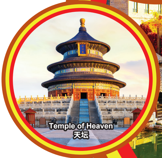
Temple of Heaven 天坛