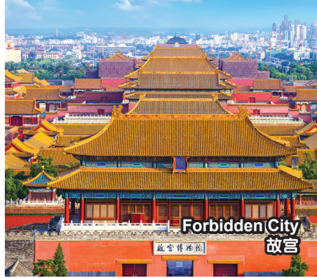
Forbidden City 故宫