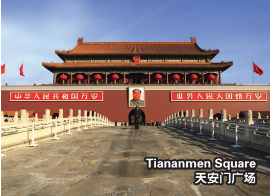
Tiananmen Square 天安门广场