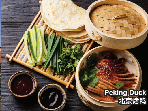
Peking Duck 北京烤鸭