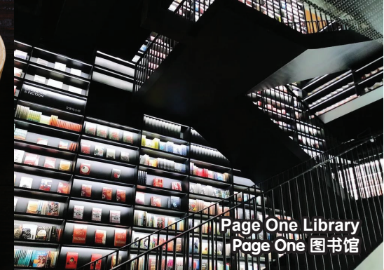
Page One Library Page One 图书馆