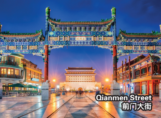
Qianmen Street 前门大街