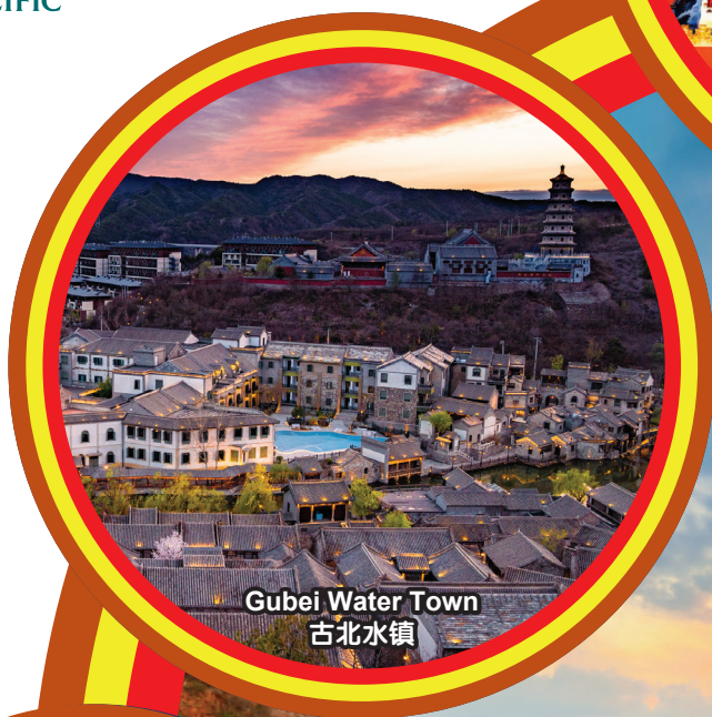
Gubei Water Town 古北水镇