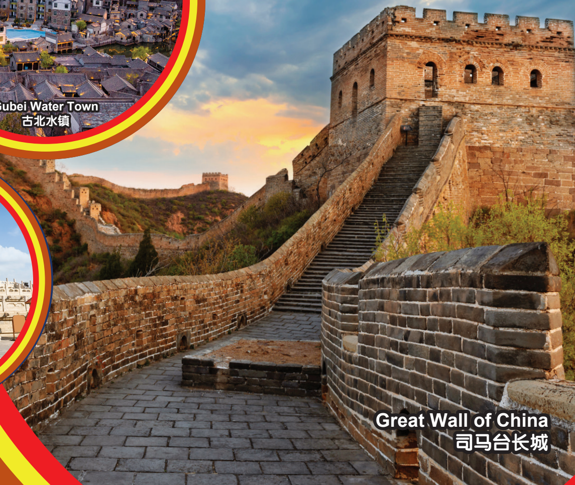
司马台长城 Great Wall of China

行程次序，以当地旅社安排为准。 Sequences of Itinerary are subject to local arrangement.