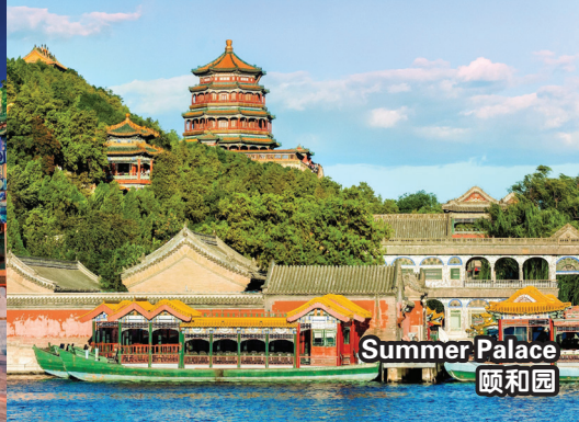
Summer Palace 颐和园