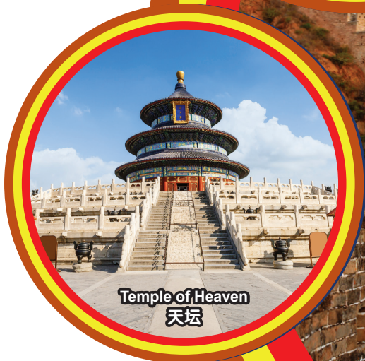
天坛 Temple of Heaven

行程次序，以当地旅社安排为准。 Sequences of Itinerary are subject to local arrangement.