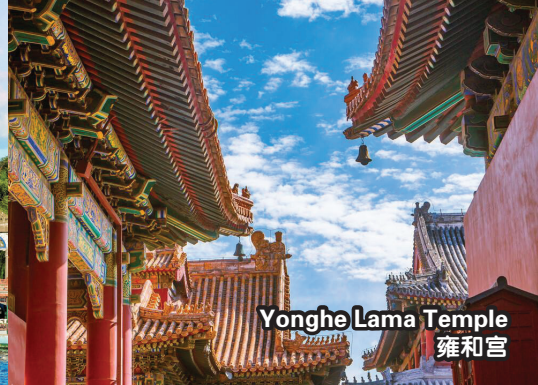
Yonghe Lama Temple 雍和宫