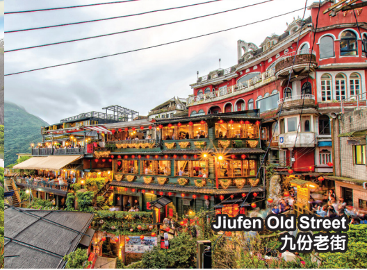
Jiufen Old Street 九份老街