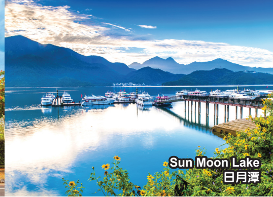
Sun Moon Lake 日月潭