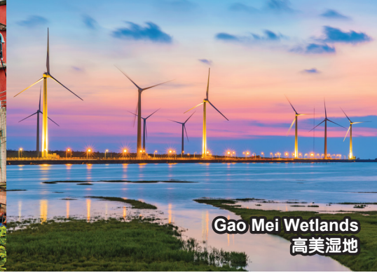
Gao Mei Wetlands 高美湿地