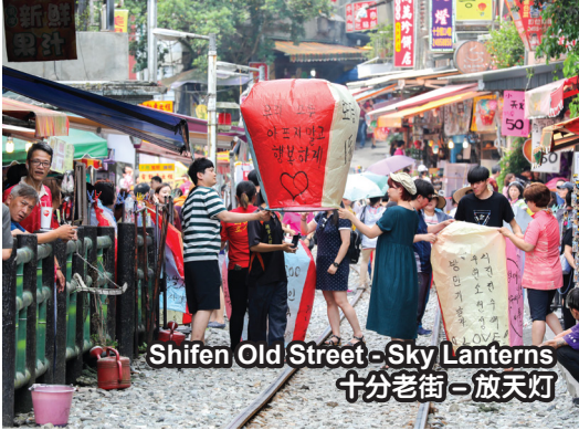
Shifen Old Street - Sky Lanterns 十分老街 - 放天灯