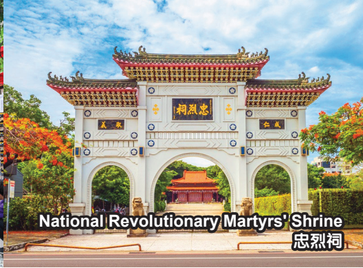
National Revolutionary Martyrs' Shrine 忠烈祠