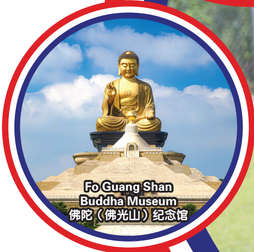
Fo Guang Shan Buddha Museum 佛陀(佛光山)纪念馆