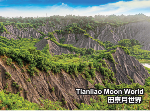
Tianliao Moon World 田寮月世界