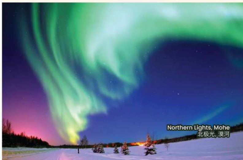
Northern Lights, Mohe 北极光, 漠河