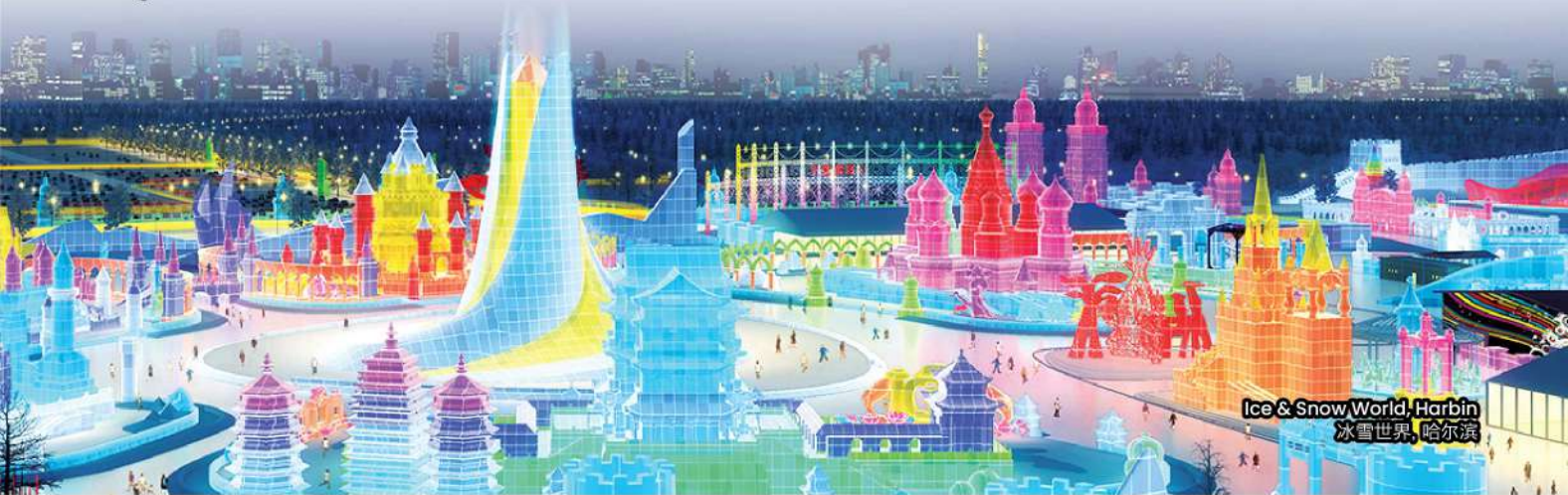
Ice & Snow World, Harbin 冰雪世界, 哈尔滨