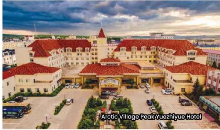
Arctic Village Peak Yuezhijue Hotel