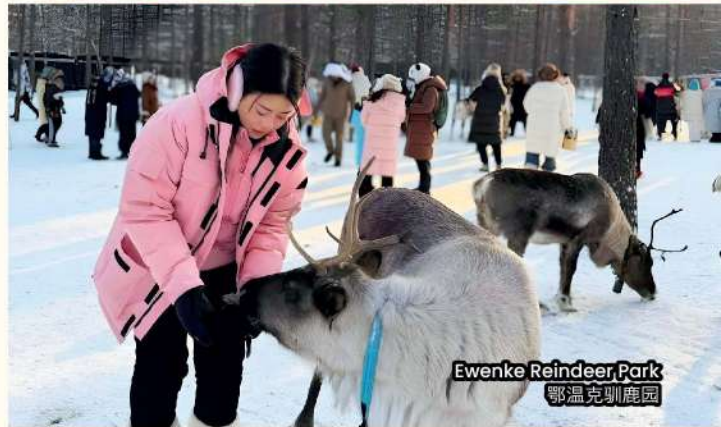
Ewenke Reindeer Park 鄂温克驯鹿园