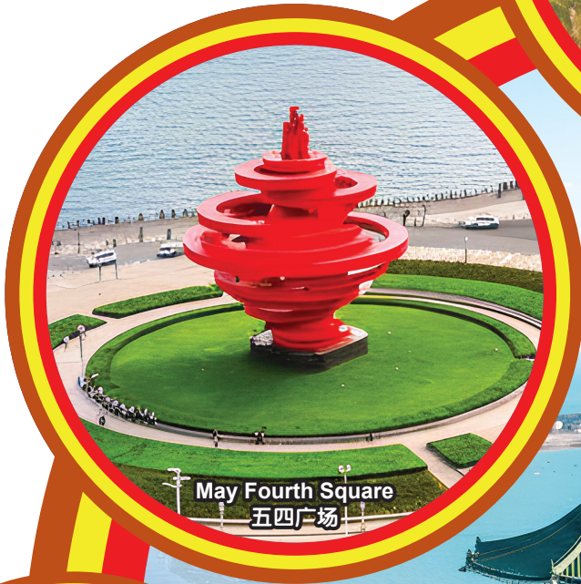
May Fourth Square 五四广场