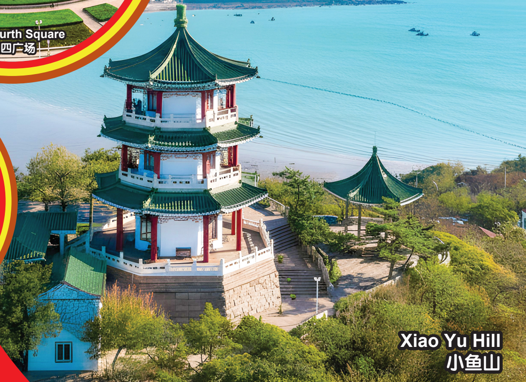
Xiao Yu Hill 小鱼山

Picture shown are for illustration purpose only *图片仅供参考