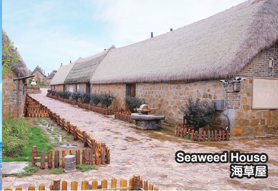
Seaweed House 海草屋