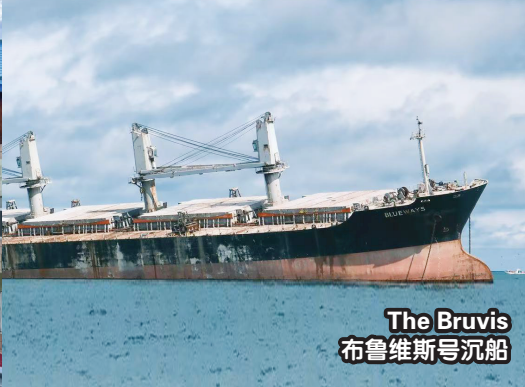
The Bruvis 布鲁维斯号沉船