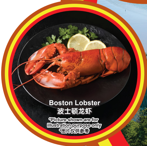
Boston Lobster 波士顿龙虾

Picture shown are for illustration purpose only *图片仅供参考