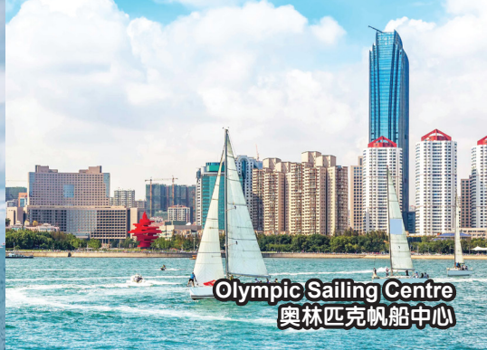
Olympic Sailing Centre 奥林匹克帆船中心