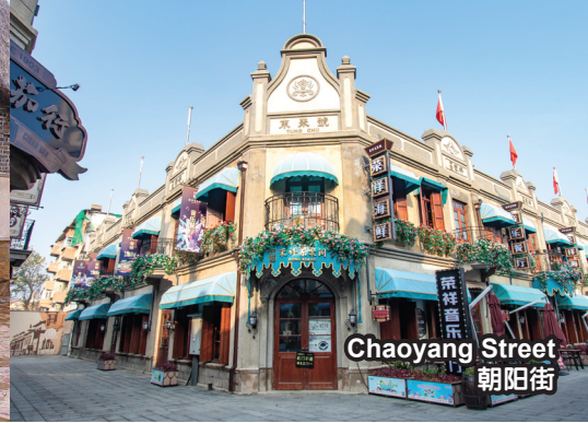
Chaoyang Street 朝阳街