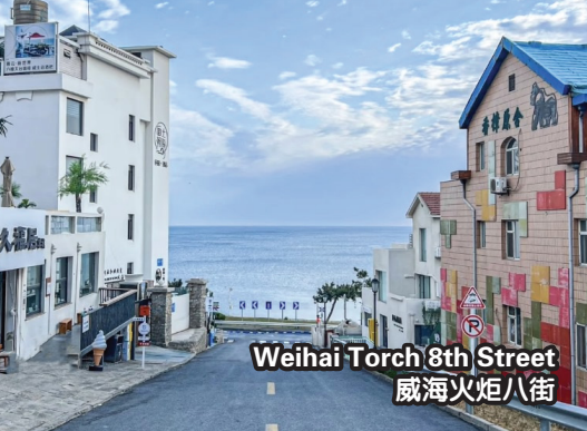
Weihai Torch 8th Street 威海火炬八街