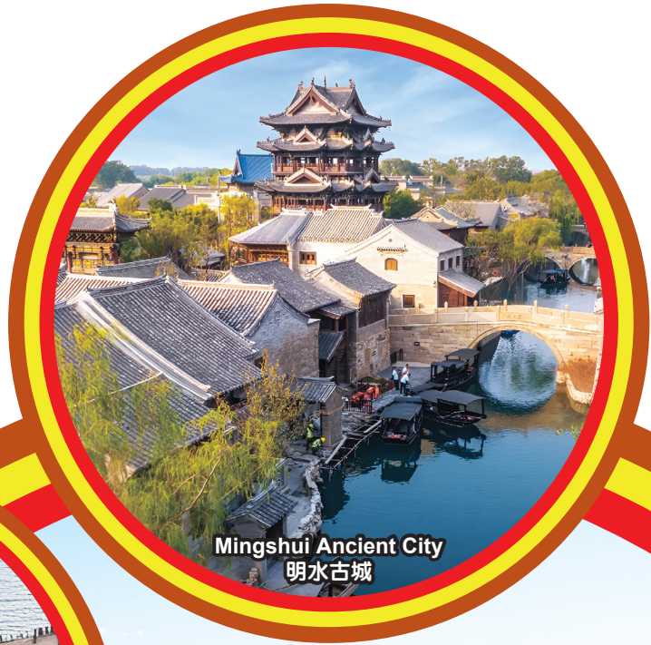
Mingshui Ancient City 明水古城