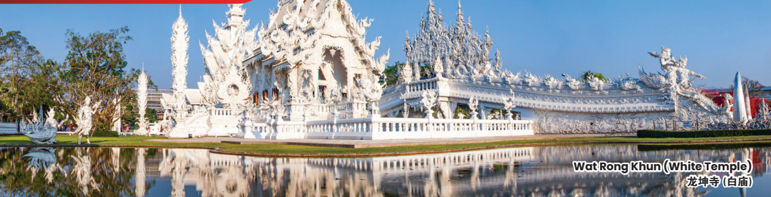
Wat Rong Khun (White Temple) 龙坤寺 (白庙)