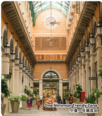
One Nimman Trendy Zone 宁曼一号潮流区