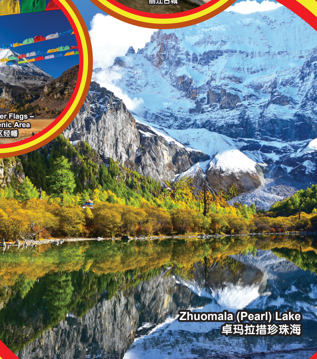
Zhuomala (Pearl) Lake 卓玛拉措珍珠海