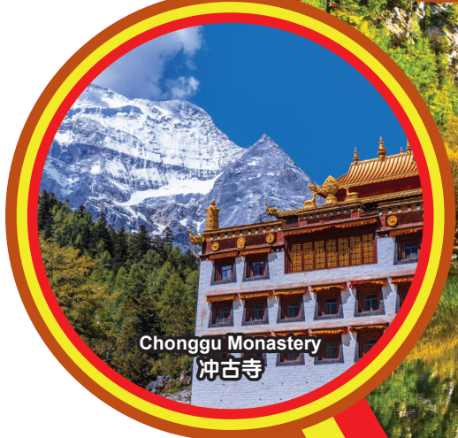
Chonggu Monastery 冲古寺