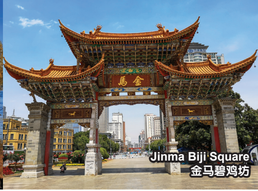
Jinma Biji Square 金马碧鸡坊