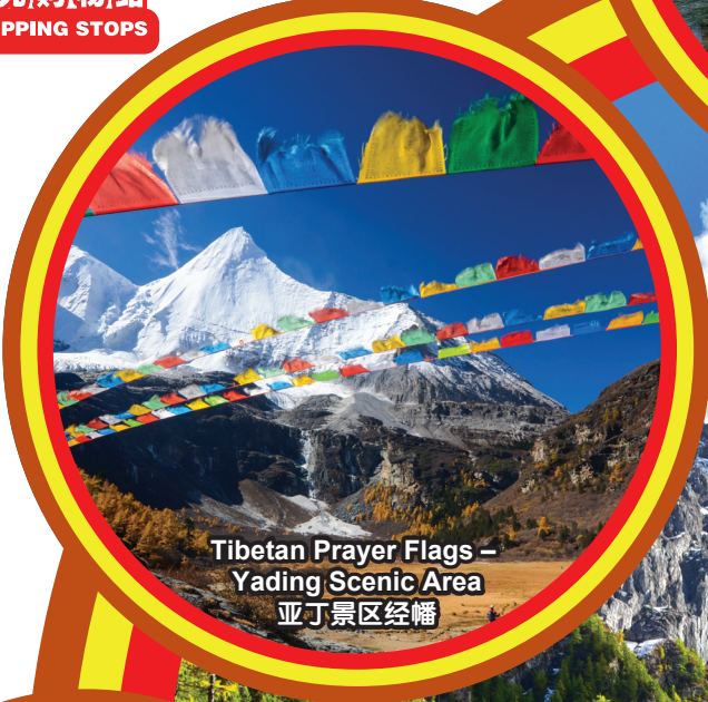
Tibetan Prayer Flags - Yading Scenic Area 亚丁景区经幡