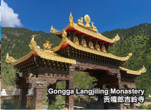
Gongga Langjiling Monastery 贡嘎郎吉岭寺