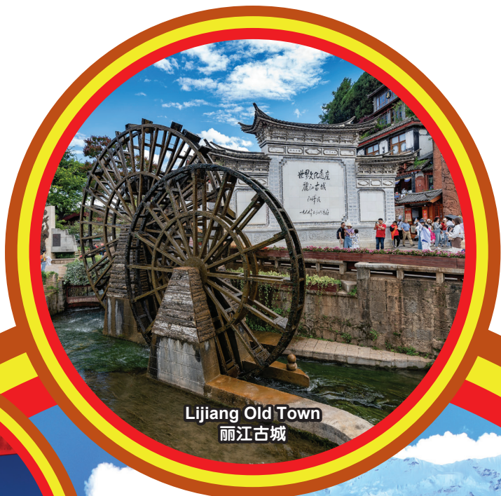
Lijiang Old Town 丽江古城