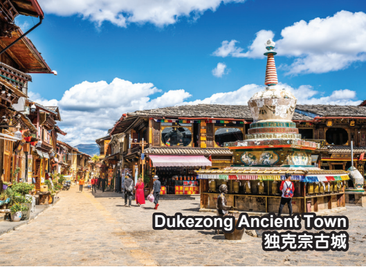
Dukezong Ancient Town 独克宗古城