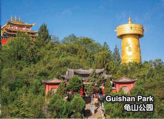
Guishan Park 龟山公园