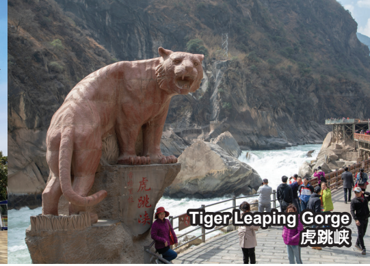
Tiger Leaping Gorge 虎跳峡