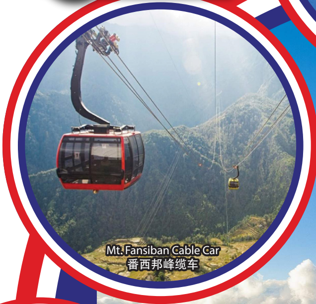
Mt. Fansipan Cable Car 番西邦峰缆车