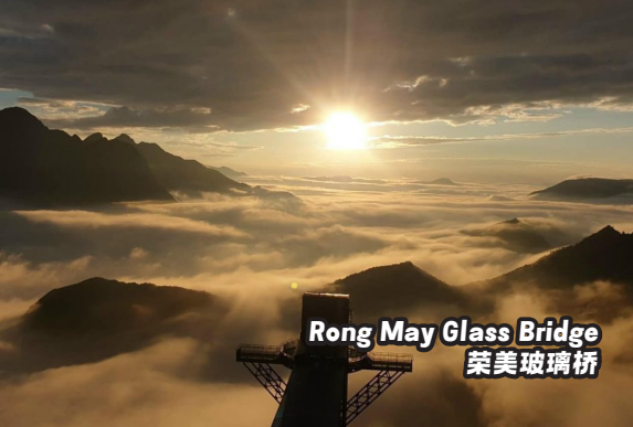
Rong May Glass Bridge 荣美玻璃桥