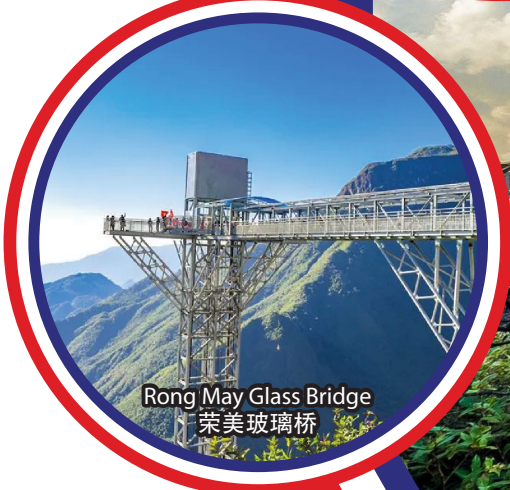
Rong May Glass Bridge 荣美玻璃桥