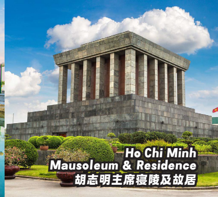
Ho Chi Minh Mausoleum & Residence 胡志明主席寝陵及故居