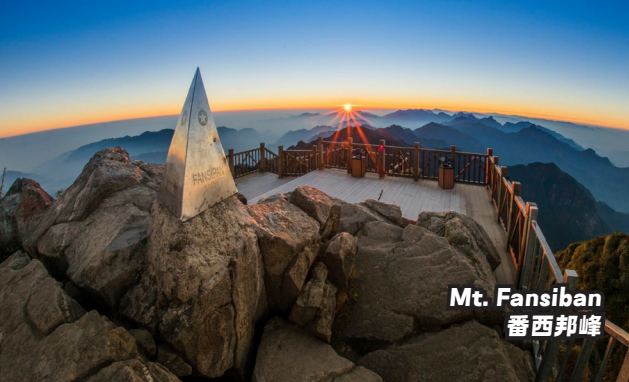
Mt. Fansipan 番西邦峰