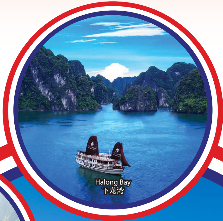
Halong Bay 下龙湾