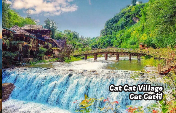
Cat Cat Village Cat Cat村