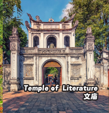
Temple of Literature 文庙