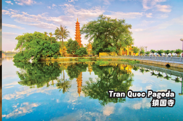
Tran Quoc Pagoda 镇国寺