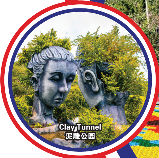
Clay Tunnel 泥雕公园