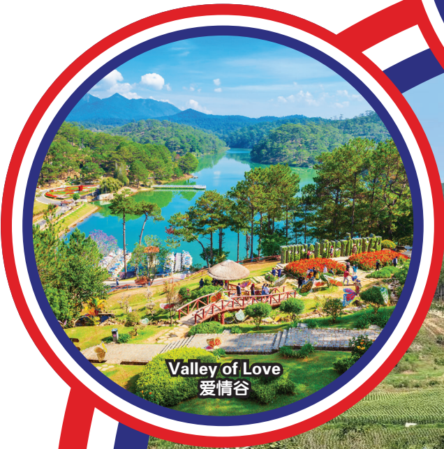
Valley of Love 爱情谷