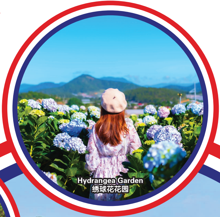
Hydrangea Garden 绣球花花园