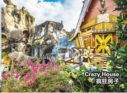
Crazy House 疯狂房子