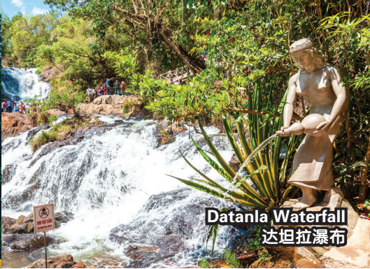
Datanla Waterfall 达坦拉瀑布