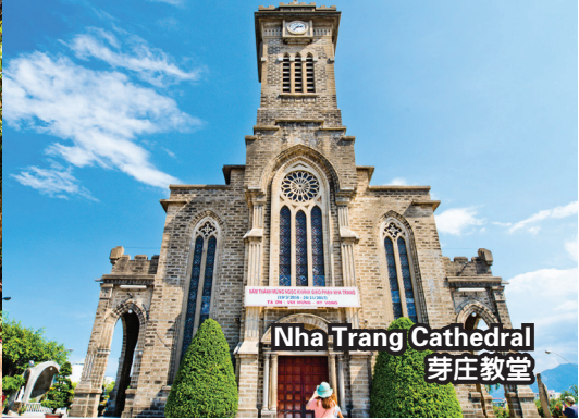
Nha Trang Cathedral 芽庄教堂