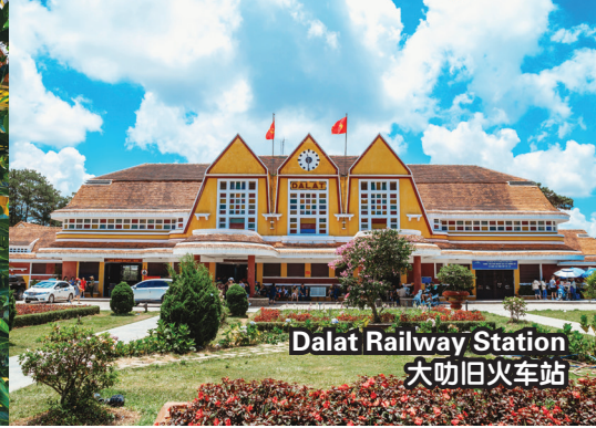
Dalat Railway Station 大叻旧火车站