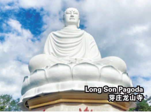
Long Son Pagoda 芽庄龙山寺