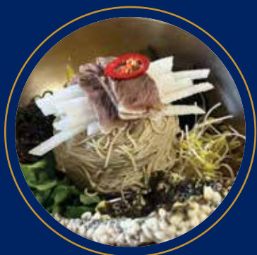
Buckwheat Makguksu 荞麦面