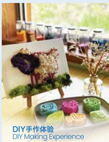
DIY手作体验 DIY Making Experience