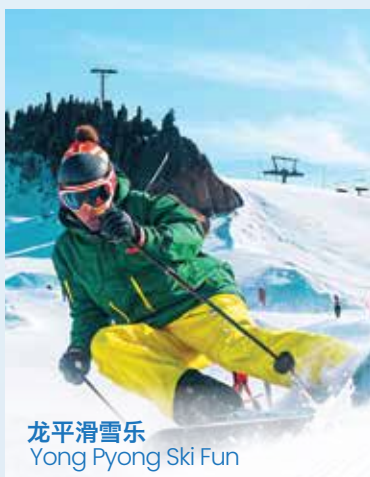
龙平滑雪乐 Yong Pyong Ski Fun