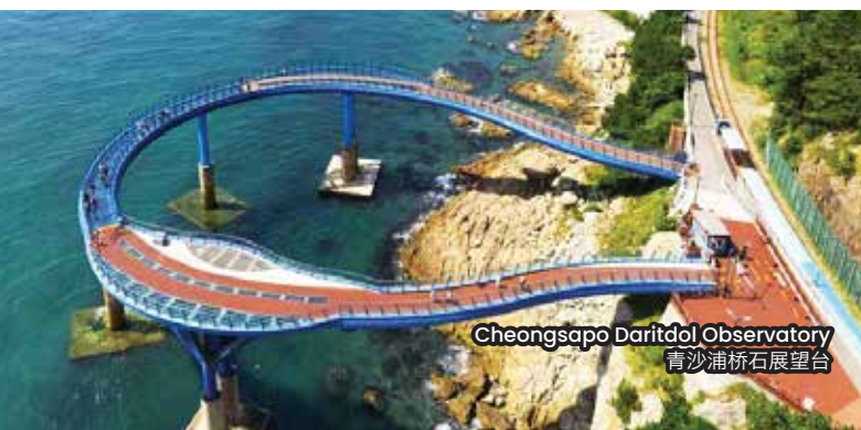
Cheongsapo Baridol Observatory 青沙浦桥石展望台