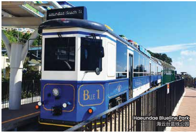
Haeundae Blueline Park 海云台蓝线公园