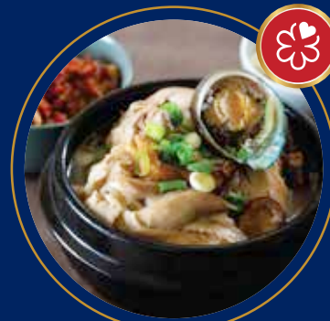
Abalone Ginseng Chicken Soup 鲍鱼人蔘鸡汤