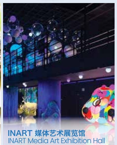
INART 媒体艺术展览馆 INART Media Art Exhibition Hall