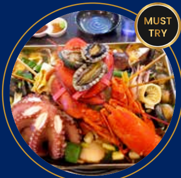
Emperor Submarine Seafood Pot 皇帝潜水艇海鲜锅