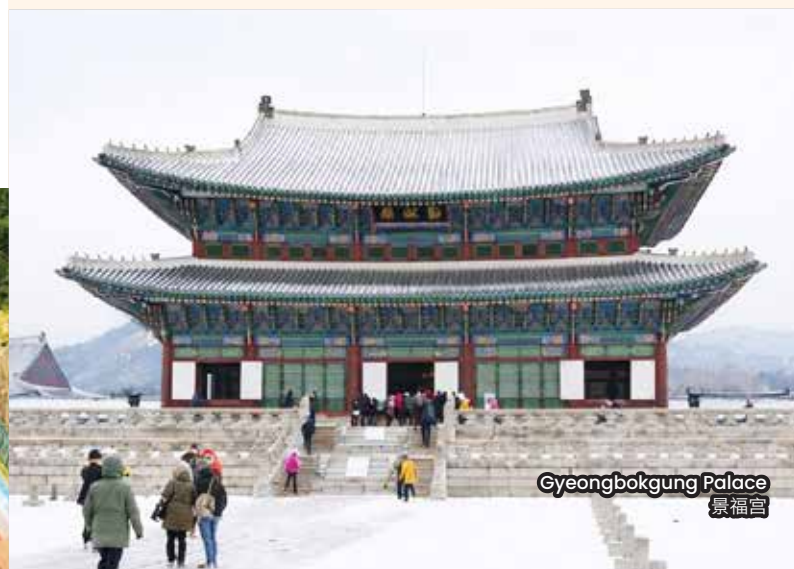
Gyeongbokgung Palace 景福宫

行程次序以当地旅行社安排为准。行程，膳食，住宿，交通等可能会因不可抗拒因素而更动，恕不另行通知。