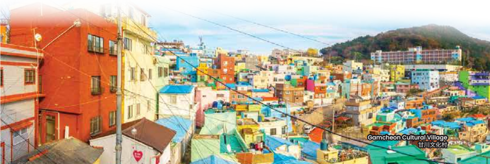
Gamcheon Cultural Village 甘川文化村