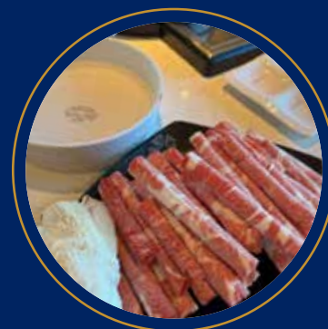
Hanwoo/Pork Premium Shabu-Shabu 韩牛/猪肉精品刷刷锅