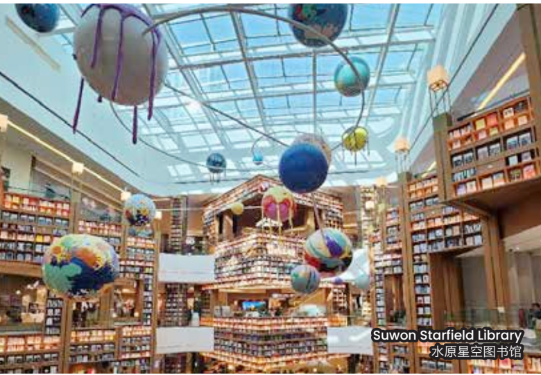
Suwon Starfield Library 水原星空图书馆