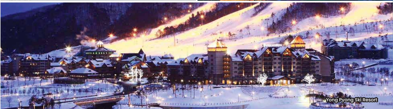
Yong Pyong Ski Resort