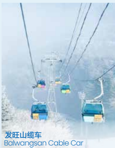
发旺山缆车 Balwangsang Cable Car