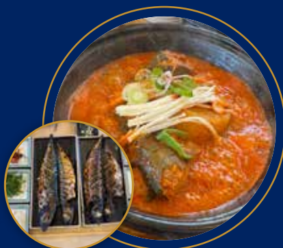
Korean Style Grilled & Braised Mackerel 韩式烤炖青花鱼