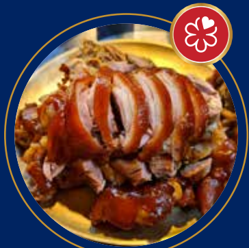
Pork Knuckle 韩式炖猪蹄套餐

我们精选当地特色餐厅，而非传统的团体餐厅。美食不仅是味蕾的享受，更是文化的体验。入乡随俗，品味正宗韩国风味，在每一口之间感受地道的风土人情。